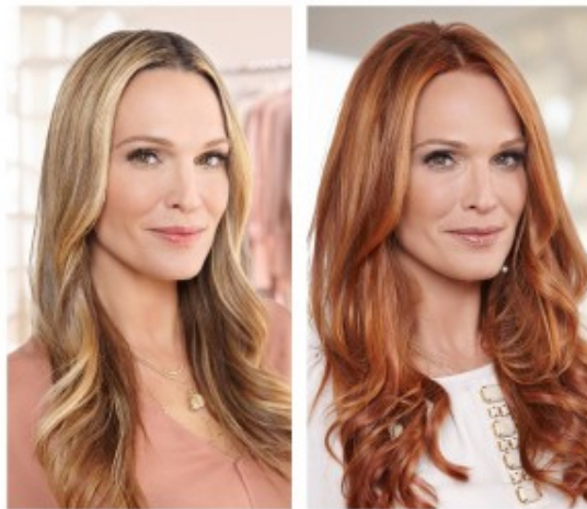
Molly Sims.

When it comes to keeping her red color, the former Sports Illustrated supermodel depends on Nexxus Color Assure products. “If something’s going to save me time and make me look good, I’m all for it!” she enthuses.