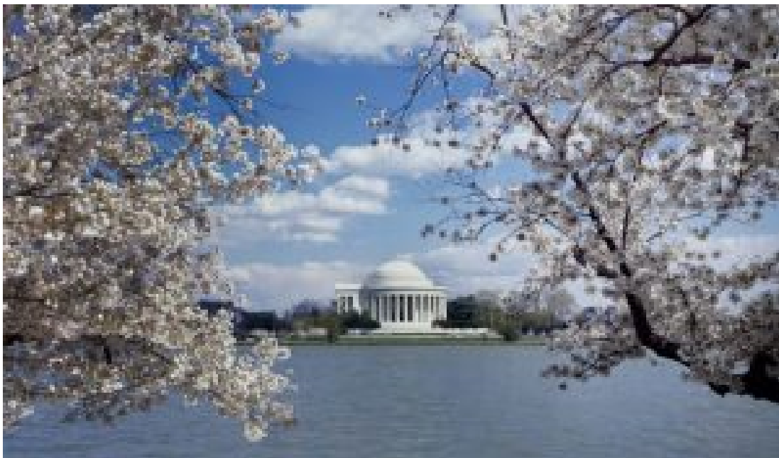
Scenic view of Cherry Blossoms and the Jefferson Memorial in Washington, D.C.

3. Washington, D.C.: Do you or your loved one enjoy discussing history, politics and government? Then a trip to the nation's capital might be a fun spring break vacation. Late March and early April are perfect times to visit because the city's Cherry Blossom Festival is celebrated during this time, which is super romantic for couples! Almost all of the museums and monuments are free, so you'll save a bunch of money while you explore the capital. Washington, D.C. is easily accessible, especially for those on the East Coast. You can get there by car, bus, train or plane. Don't fret if you live on the West Coast however, round trip flights from LAX to D.C. are as low as $107. Since D.C. is a major city, hotels are on the pricey side, but look for places that include lodging and breakfast, such as the Windsor Park Hotel which goes for $153 a night, and the Comfort Inn for $111 per night. D.C. is also known for its unique restaurants like Bindaas, which is famous for its Indian-inspired menu, and &Pizza, where you can customize your own pizza and gulp down artisanal soda.