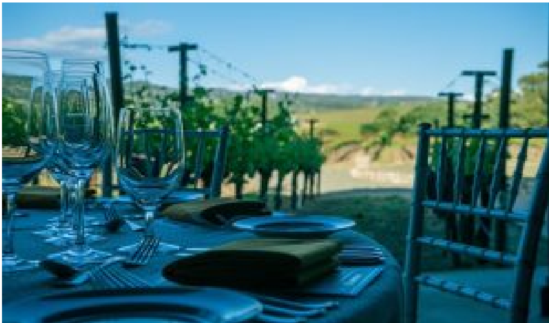
Shot of a table with wine glasses in Sonoma County, California.

activities such as hiking and horseback riding. Sonoma is roughly 50 miles from San Francisco and Oakland, so it's accessible by car if you aren't far from there. For those who live farther, it's also much cheaper to take a flight to San Francisco or Oakland than taking a direct flight to Sonoma. However, round trip flights from JFK around the time of March and April are in the $300 range, so be wary East Coast budget travelers. Also, hotels in Sonoma are on the higher-end side, so it might be better to save money with value lodging at the Best Western Sonoma Valley Inn for $138 a night and the Sonoma Creek Inn for $126 per night. If you're a big wine fan, there are countless wine tours you can take. Platyus Wine Tours provides guests four visits to family owned wineries for $110 per person, and includes a picnic lunch, while Valley Wine Tours provides four to five winery visits for $135, and includes a gourmet lunch. If wine tours aren't your thing, you can have fun exploring the Sonoma Plaza, which has plenty of boutiques, galleries and restaurants.