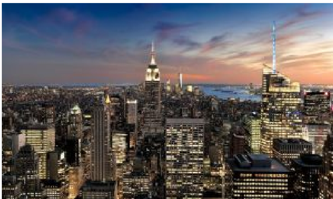
New York City skyline at sunset.

Pass for $116 for admission to the Empire State Building, Metropolitan Museum of Art, and the 9/11 Memorial & Museum; or just stick to free and donation-based attractions. Parking can be a nightmare, so If you don't live far, you can take a bus or Amtrak train to Penn Station and transfer to a subway line. However, for those who live farther, like the West Coast, a round trip flight from LAX to New York is about $320. If you're a budget traveler, save money by staying at hotel with a communal bathroom like the Jane Hotel for $59 a night, or get your own space at the chic Row NYC for $146 per night. As for food, you have over 24,000 restaurants to choose from- so you're sure to find places that fit your budget easy for date night.