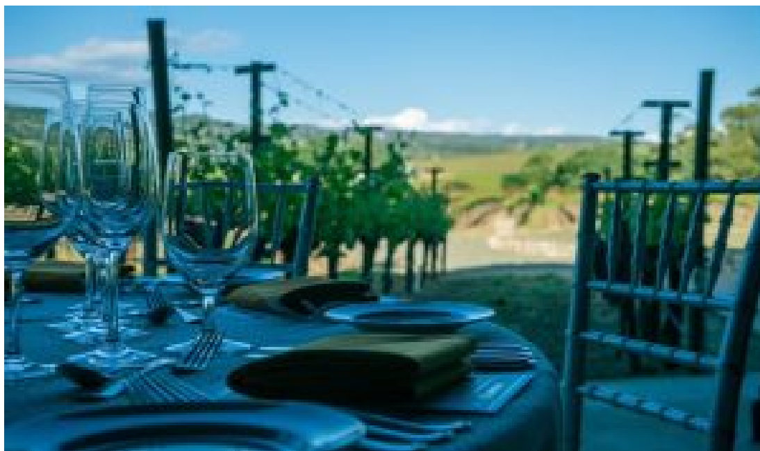
Shot of a table with wine glasses in Sonoma County, California.

activities such as hiking and horseback riding. Sonoma is roughly 50 miles from San Francisco and Oakland, so it's accessible by car if you aren't far from there. For those who live farther, it's also much cheaper to take a flight to San Francisco or Oakland than taking a direct flight to Sonoma. However, round trip flights from JFK around the time of March and April are in the $300 range, so be wary East Coast budget travelers. Also, hotels in Sonoma are on the higher-end side, so it might be better to save money with value lodging at the Best Western Sonoma Valley Inn for $138 a night and the Sonoma Creek Inn for $126 per night. If you're a big wine fan, there are countless wine tours you can take. Platyus Wine Tours provides guests four visits to family owned wineries for $110 per person, and includes a picnic lunch, while Valley Wine Tours provides four to five winery visits for $135, and includes a gourmet lunch. If wine tours aren't your thing, you can have fun exploring the Sonoma Plaza, which has plenty of boutiques, galleries and restaurants.