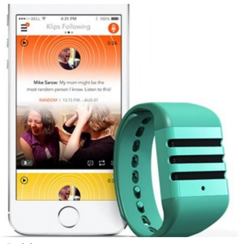
By Taylor Jenkins Reid

Before I got married, I thought married couples spent their weekends doing things like double dates and cocktail parties. But being married has taught me that marriage is a little bit more low key. Here are 10 steps for acting like a married couple on a Friday night: