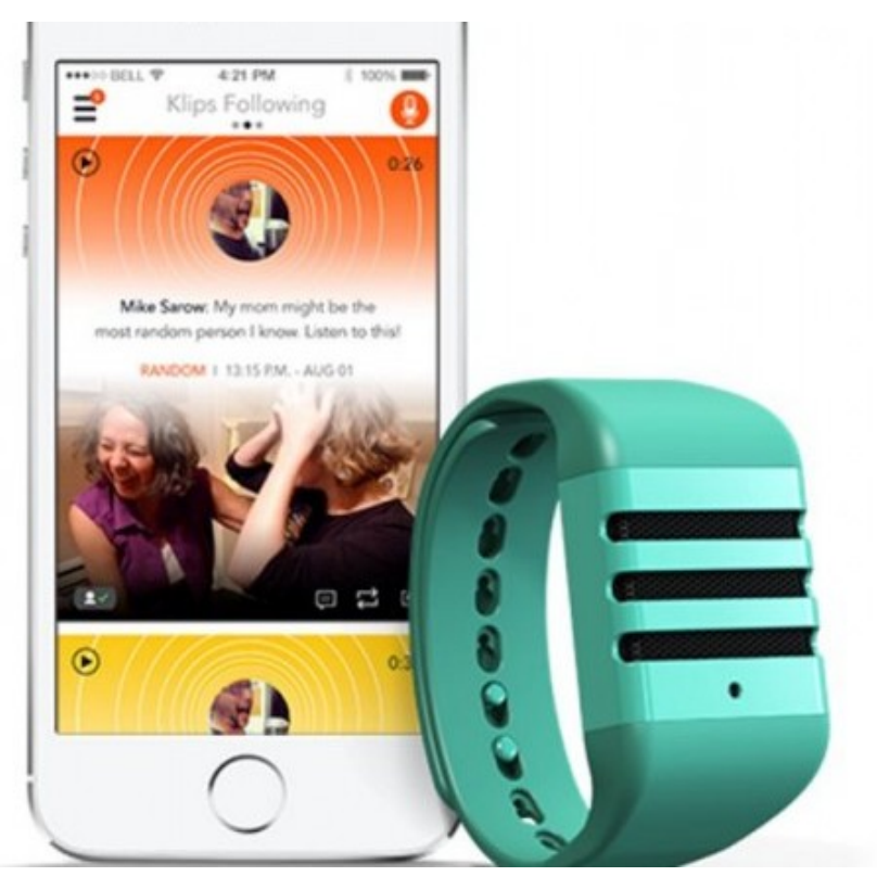
By Shannon Seibert

Cities are a haven for magical sites that capture the essence of romance. The crowds of interesting people, the hustle and bustle of traffic, and even the historical landmarks around you add to your experience. This fall weekend, embark on an adventure with your love and take in all that your hometown (or the nearest big city) has to offer with this exciting date idea!