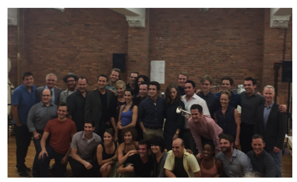
The cast of 'The Bandstand.'

What makes this play so incredibly unique compared to other Broadway shows is that a portion of the music is integrated into the story and played live on stage. There are 12 pieces in the orchestra pit and six pieces on stage. This can be extremely difficult to manage, but works so well in The Bandstand .