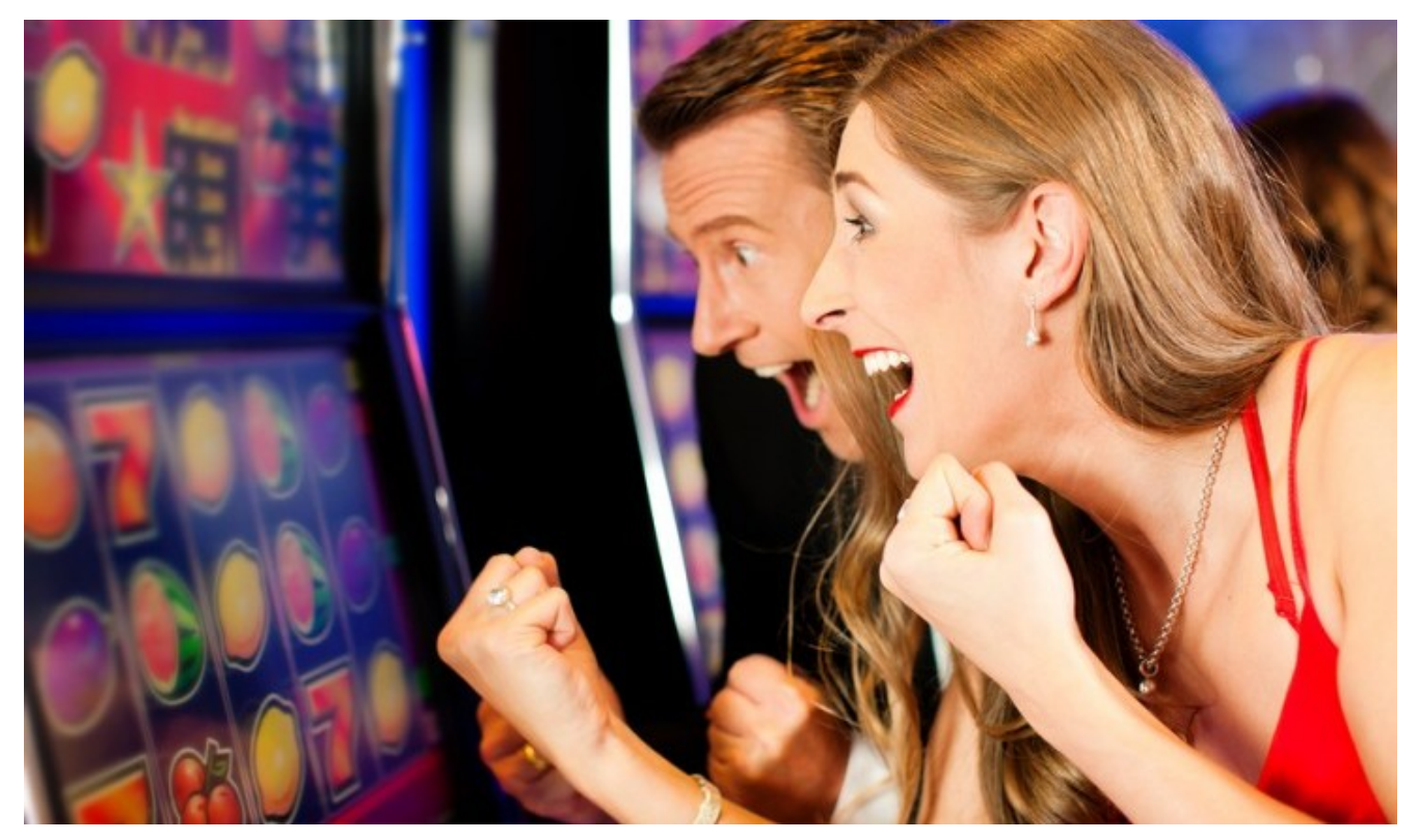
By <u>Sarah Batcheller</u> and Mara Miller

When you were a kid, there was nothing like summertime: no school for two months, water balloon fights, the classic Slip 'N Slide, and frequent pool days. Just because you're older now doesn't mean you and your boo can't enjoy some throwback fun! Follow this <u>dating advice</u> to enjoy all the summer activities you reveled in as a child.