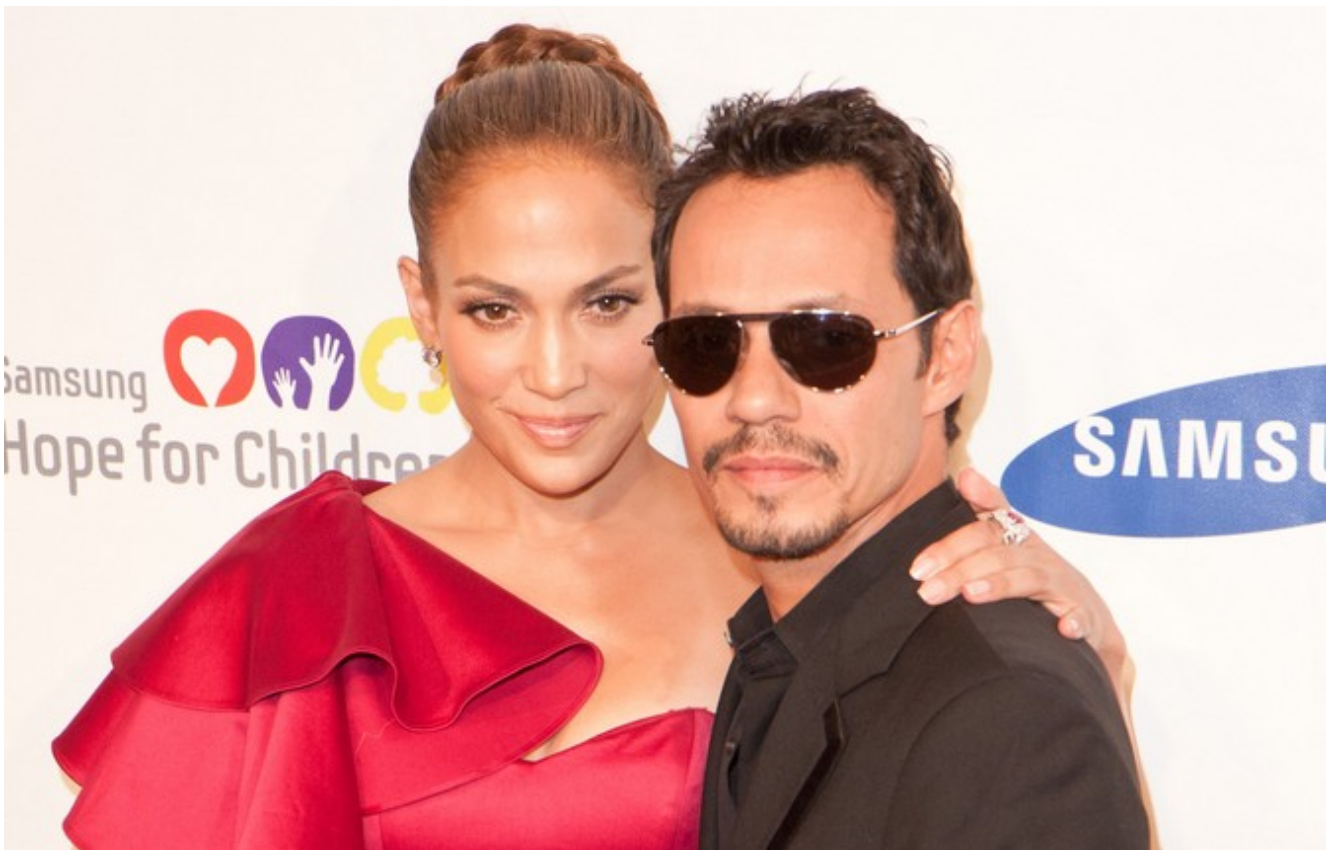
Jennifer Lopez and Marc Anthony

Although they're no longer together, the two singers co-parent and do business together. These celebrity exes didn't let