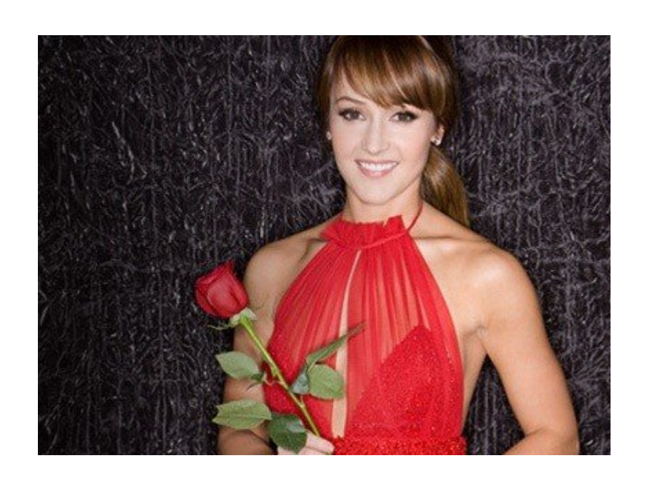
"Women have the power to control how men treat them, how we act and how we are in society."