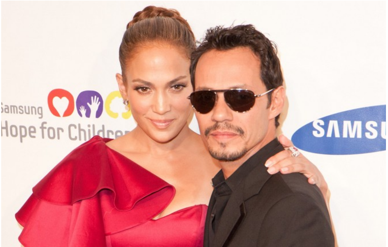
Jennifer Lopez and Marc Anthony

Although they're no longer together, the two singers co-parent and do business together. These celebrity exes didn't let their break-up get in the way of their children or career.