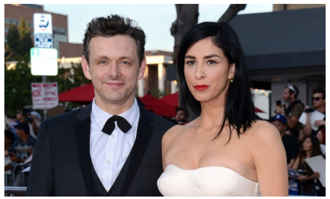
By Krissy Dolor

Think women over 40 don't have a place in Hollywood? After reading this list you'll see that isn't the case. While The Moviefone Blog came up with 40 actresses over 40 that are killin' it on the big screen, we wanted to narrow it down to our favorite 10 — but they had to be single. Why? Simple! While there's no doubt that every woman on the list is sexy and successful, we wanted to highlight the celebrities who