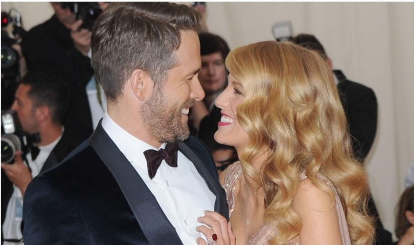
Ryan Reynolds and Blake Lively

This adorable couple met while filming 'Green Lantern,' in which Reynolds played the superhero and Lively was his love interest. They were married on September 2012 and most recently walked the red carpet together at the Cannes Film Festival.