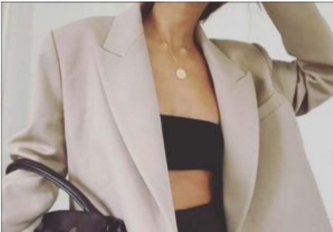
Bandeau top with cover.

From bathing suit to casual wear, bandeau tops have evolved in the fashion world. Here are some ways to take this fashion trend and make it your own: