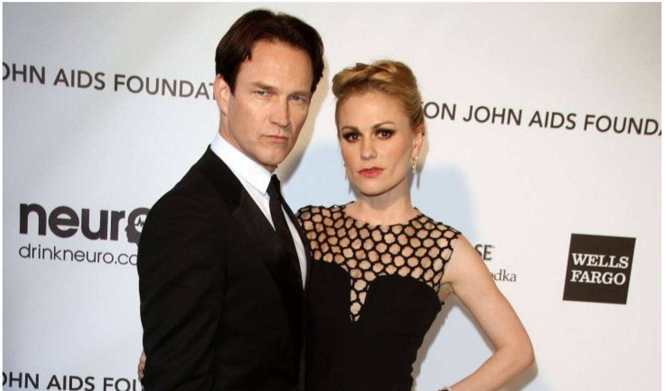
Stephen Moyer and Anna Paquin

These sexy stars of 'True Blood' wed in 2010, paying no attention to their 12-year age gap. Moyer is 45 years old, and Paquin is 33 years old.