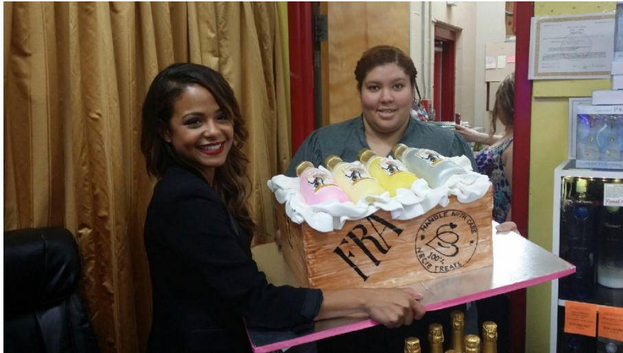
Christina Milian with Viva Diva Wines.

Related Link: Christina Milian Ends Engagement to Jas Prince