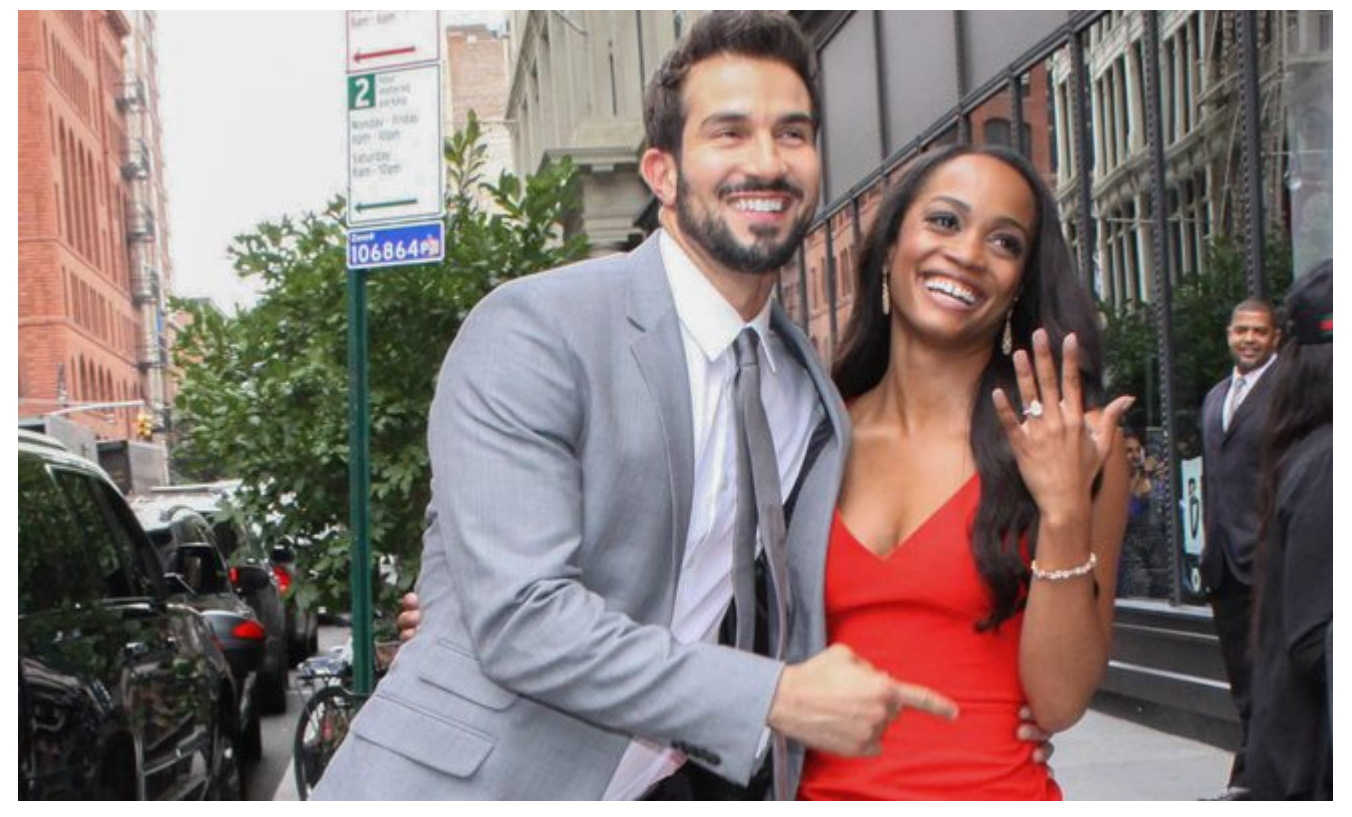
By <u>Haley Lerner</u>