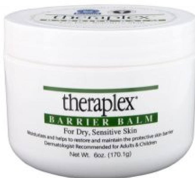
Theraplex Barrier Balm

Theraplex® isn't just for those with overly dry skin. It is for anyone looking for a gentle formula to apply to their skin when trying to keep it hydrated and moisturized, which is so important during summer. These products are guaranteed to leave you glowing on your next date night !