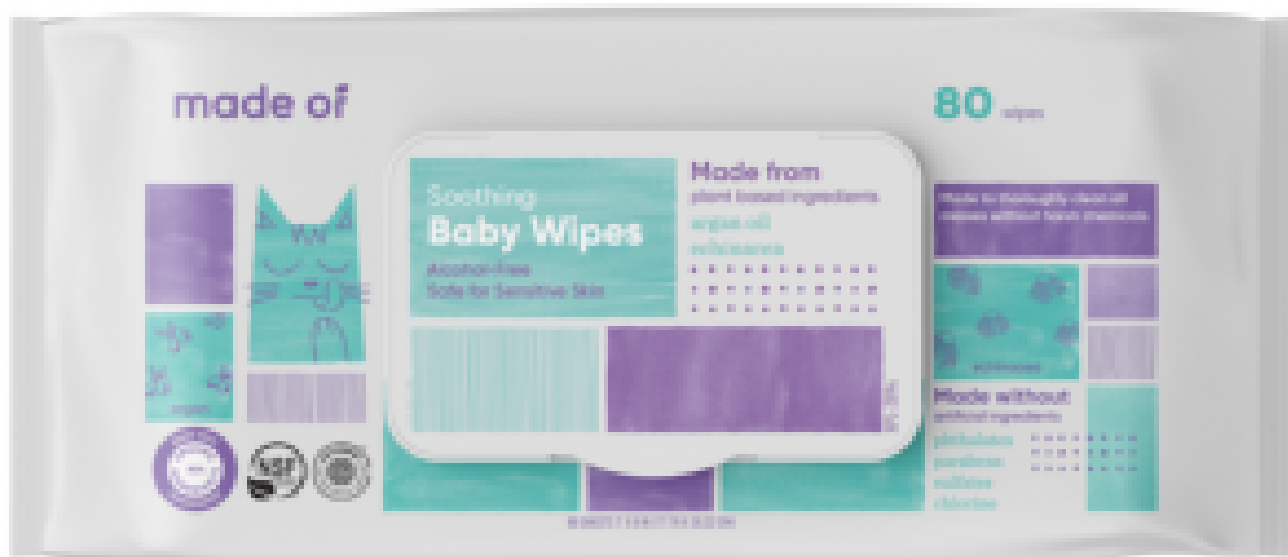
Soothing Organic Baby Wipes – 80 count , $8.00

You can finally wash your baby's dishes without the worry of using harsh chemicals! A lot of dish soap can leave a harmful residue, but MADEOF soap leaves a clean-free streak. It will make your dishes sparkling clean and get rid of all bacteria.