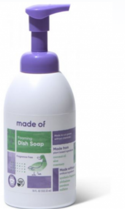
Organic Foaming Dish Soap , $9.00

You can finally wash your baby's dishes without the worry of using harsh chemicals! A lot of dish soap can leave a harmful residue, but MADEOF soap leaves a clean-free streak. It will make your dishes sparkling clean and get rid of all bacteria.