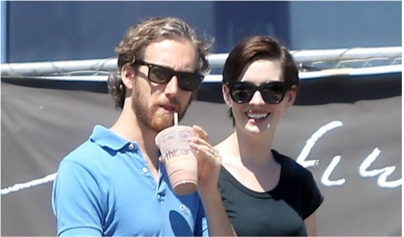
Adam Shulman and Anne Hathaway

This famous couple enjoyed a nice summer getaway in sunny Spain! The pair spent time on a yacht, soaking up the sun and playing in the water together.