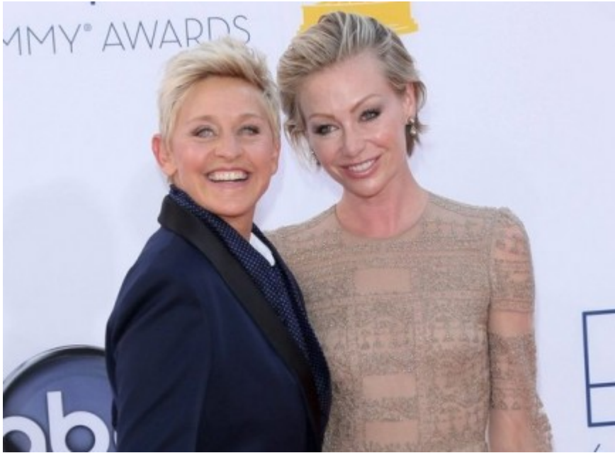
Ellen DeGeneres and Portia de Rossi

Both of these lovely ladies have written books that give insight into the struggles they've had to face. The funny lady wrote about coming out in Hollywood and her career as an actress, host, and comedian, while her wife wrote about her journey to overcome anorexia and bulimia.