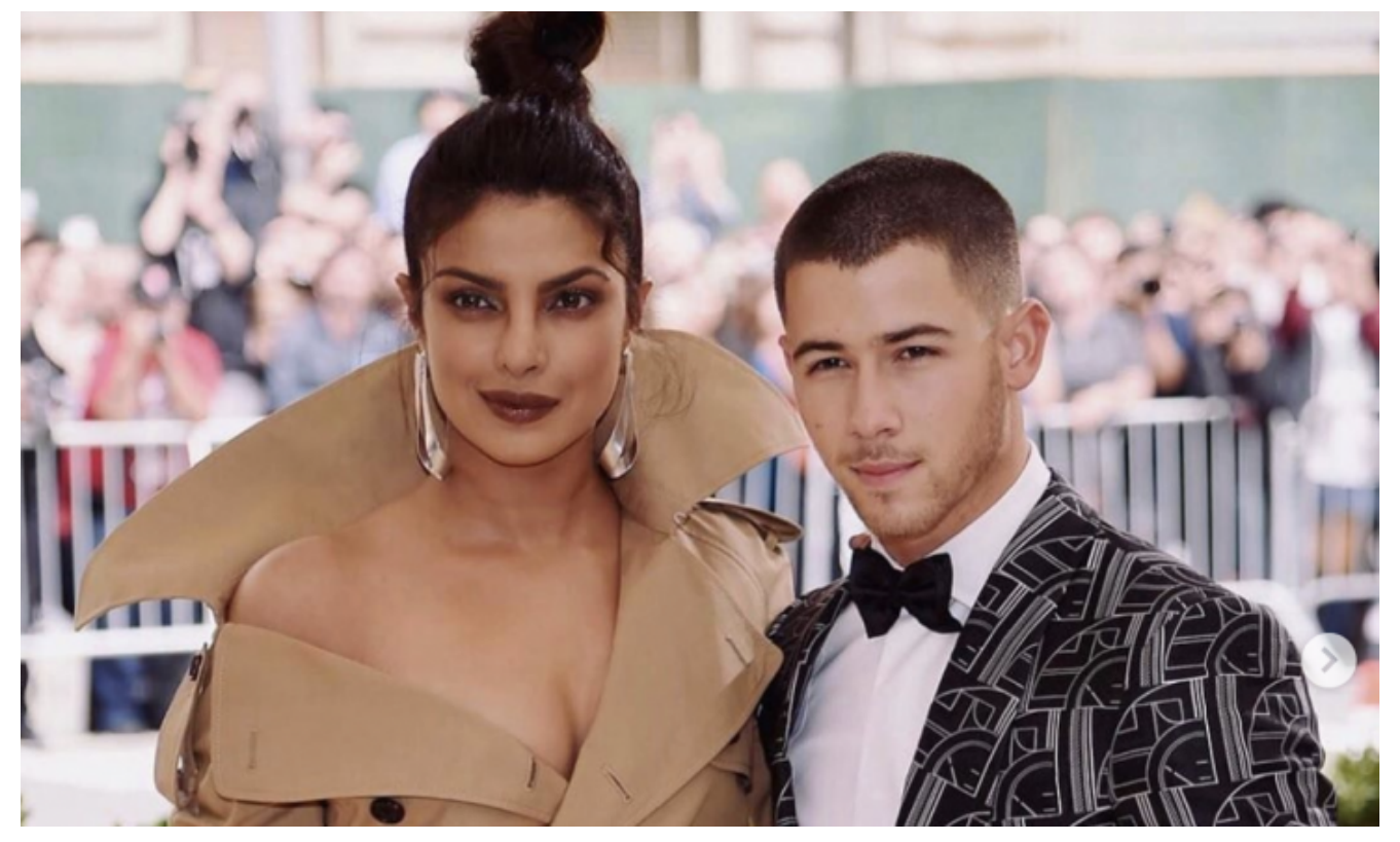
By Abbi Comphel

Some celebrity couples just couldn't handle the summer heat together. There were many celebrity break-ups in the summer of 2015.