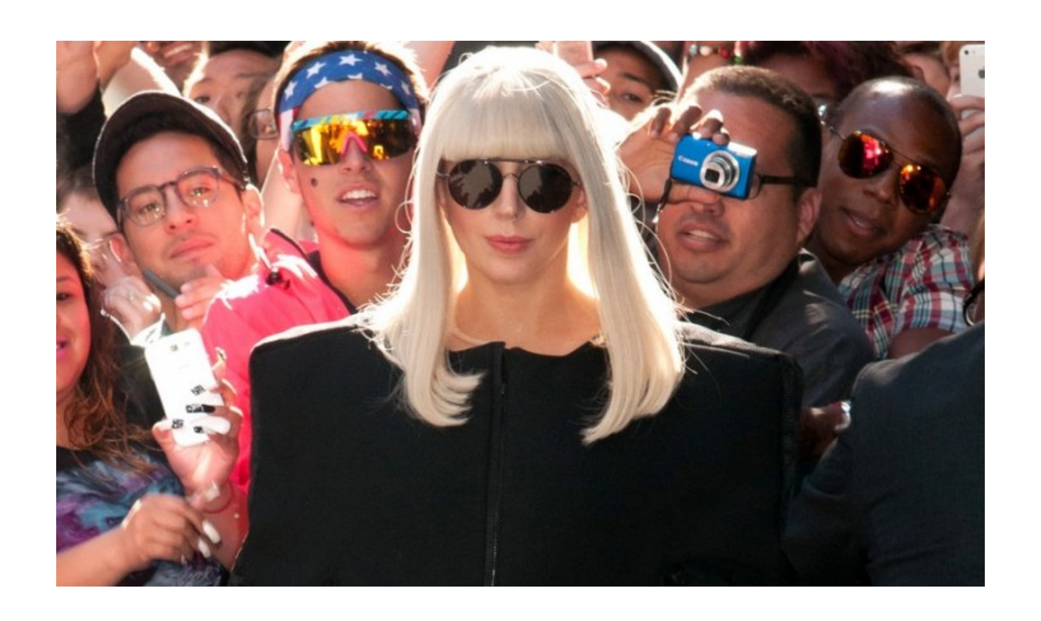
Page 1 of 20