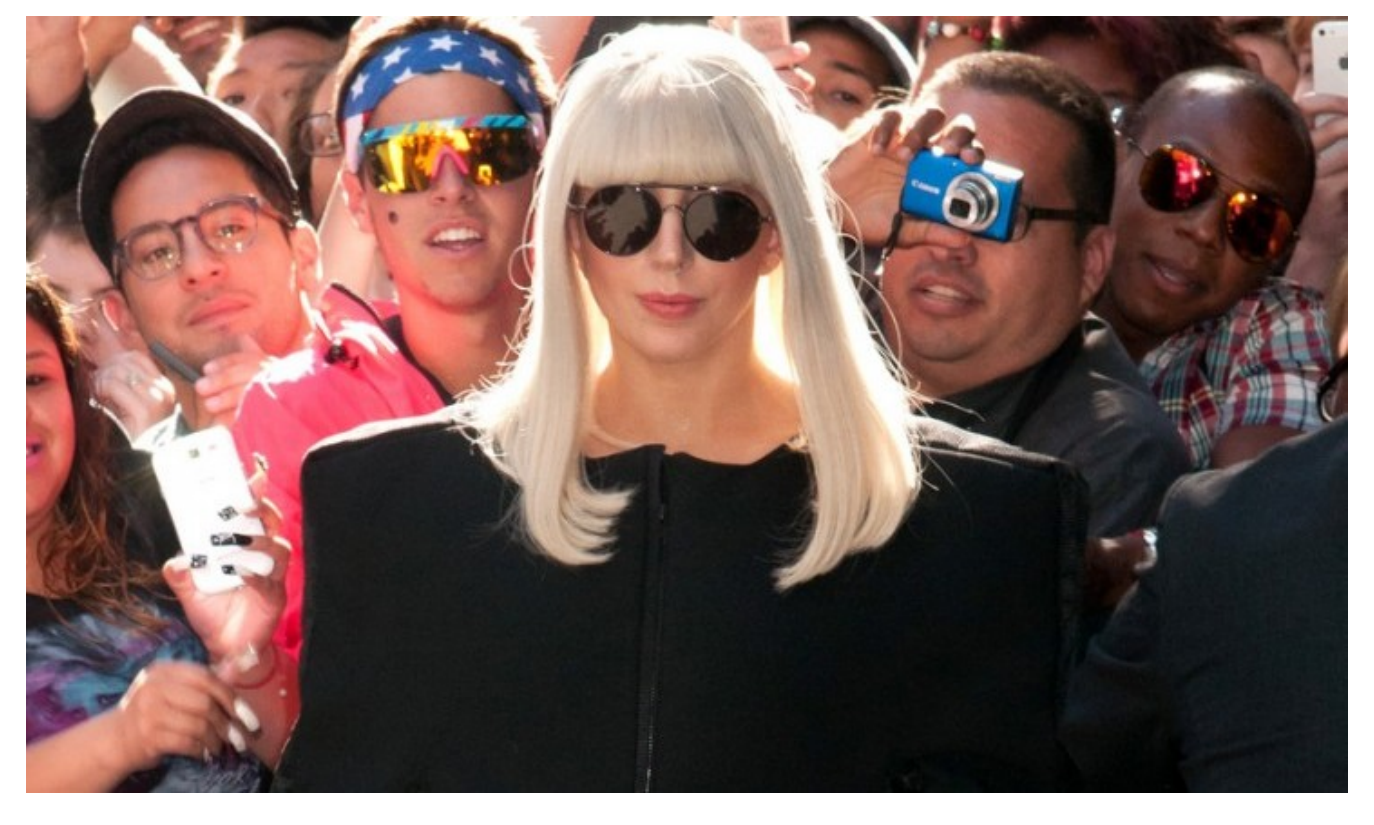
Page 1 of 20