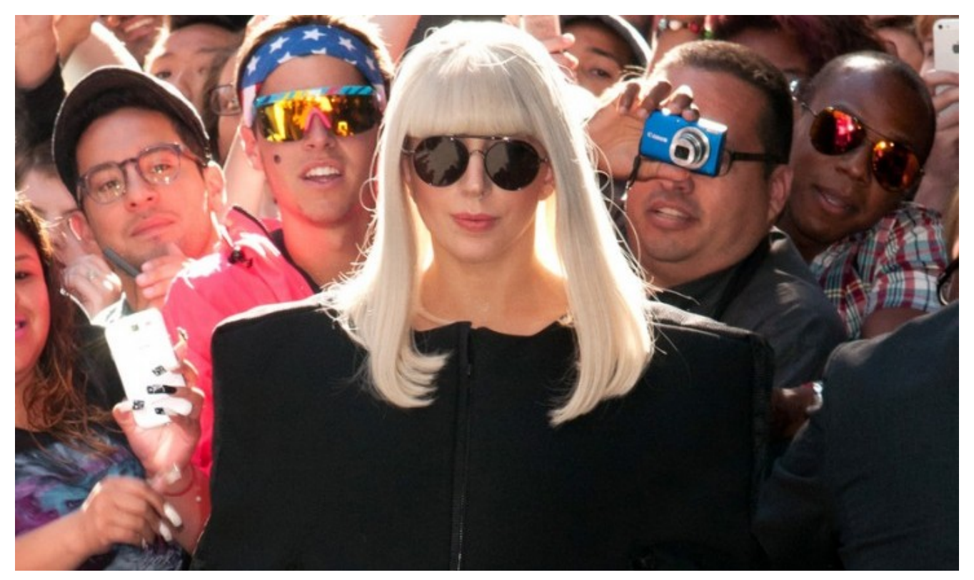
This post is sponsored by LOLO Jewellery.