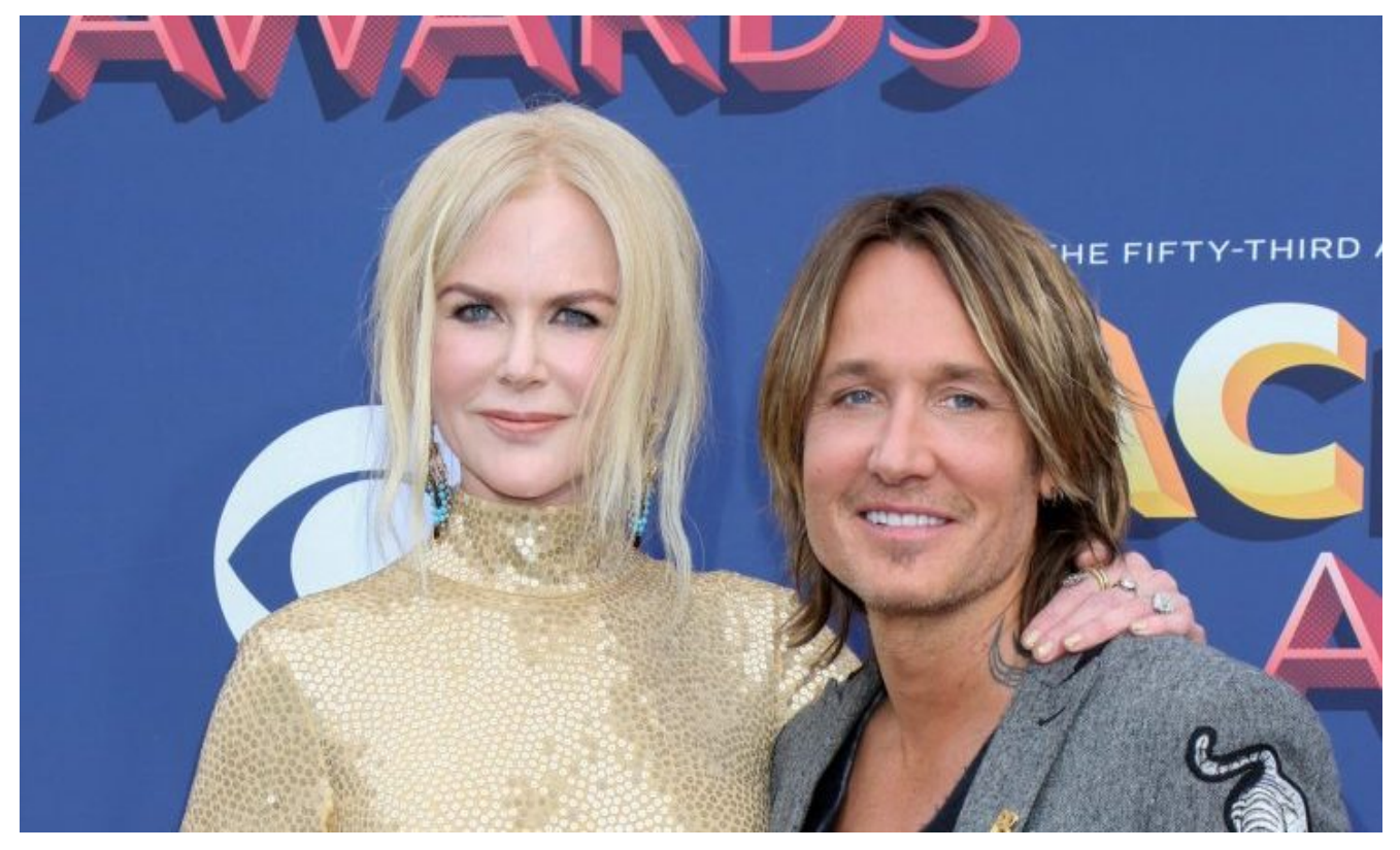
By Francesca B.

The world of celebrity is fraught with ups and downs. Scandals of drug abuse, cheating husbands and lying wives make for gripping and sensational stories when they come to public attention. We have come to expect a bit of drama from Hollywood romances, but even so, there have been some celebrity divorces that we really didn't see coming. Here are a few: