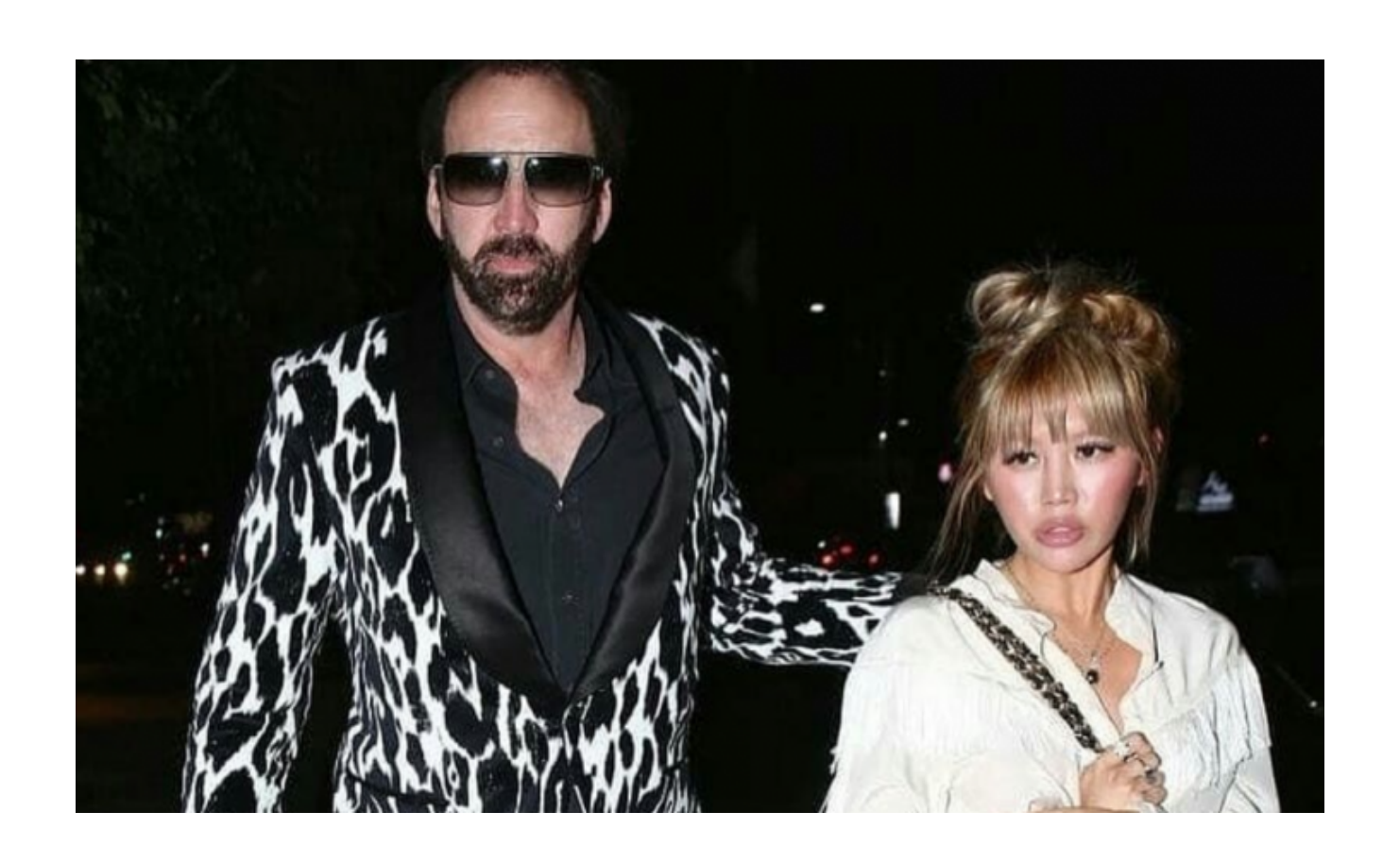
Page 1 of 14