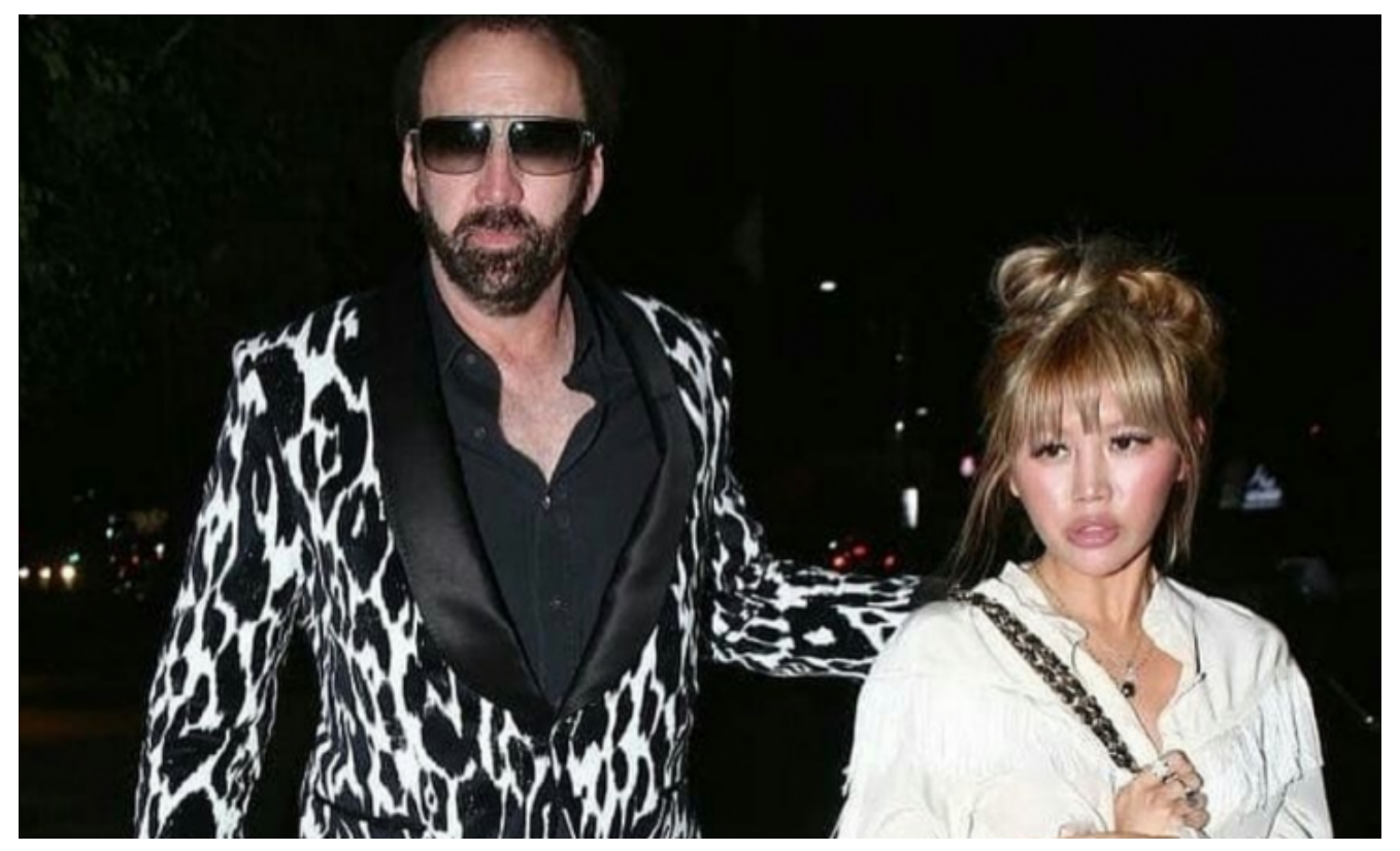
Page 1 of 19