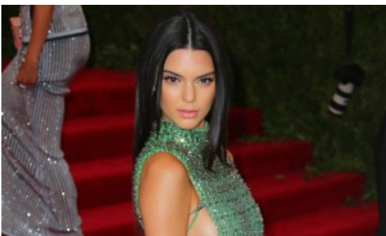
Kendall Jenner.

Related Link: New Celebrity Couple: Kendall Jenner & Harry Styles Reunite at Party