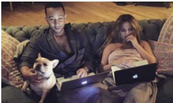
John Legend and Chrissy Teigen.

1. Take breaks from each other: Chrissy Teigen and John Legend may seem like a couple that is together 24/7, but they do spend time apart. According EOnline.com , the couple values trips away from each other because it allows them to miss being together and appreciate their relationship. Spending time apart really does make the heart grow fonder!