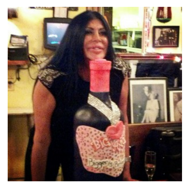
Big Ang poses with her customized wine bottle cake at her official launch party.

When asked what inspired her to create her own variety of wine, the VH1 star said, "I do own two bars; my family was in the bar business; and my mother and father were bartenders too. I just thought, 'Bars, bartenders, wine — it all went together.'"