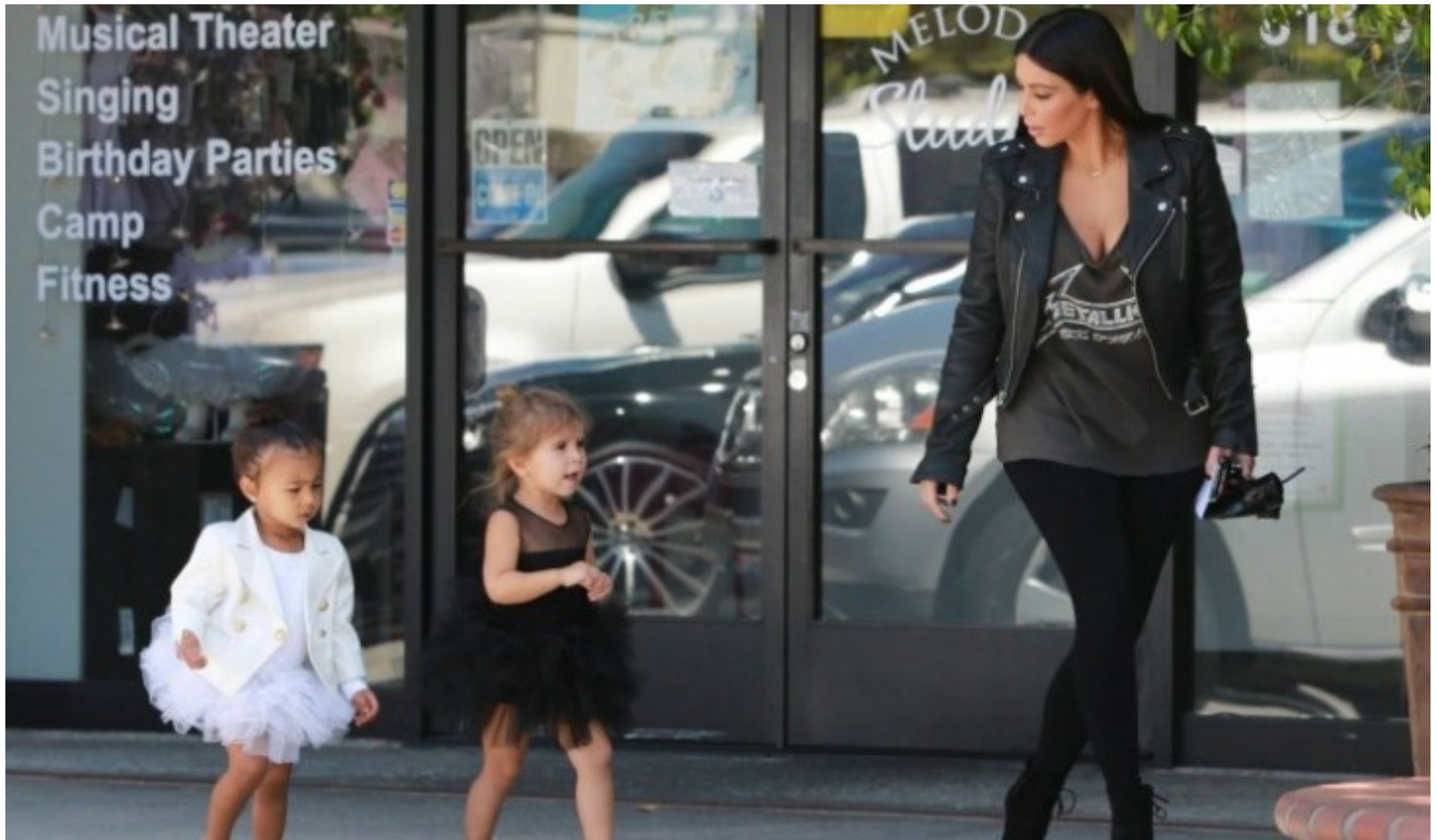
Kim Kardashian with daughter North and niece Penelope

Even celebrity kids need hobbies! North and her cousin Penelope are ready for their dance class.