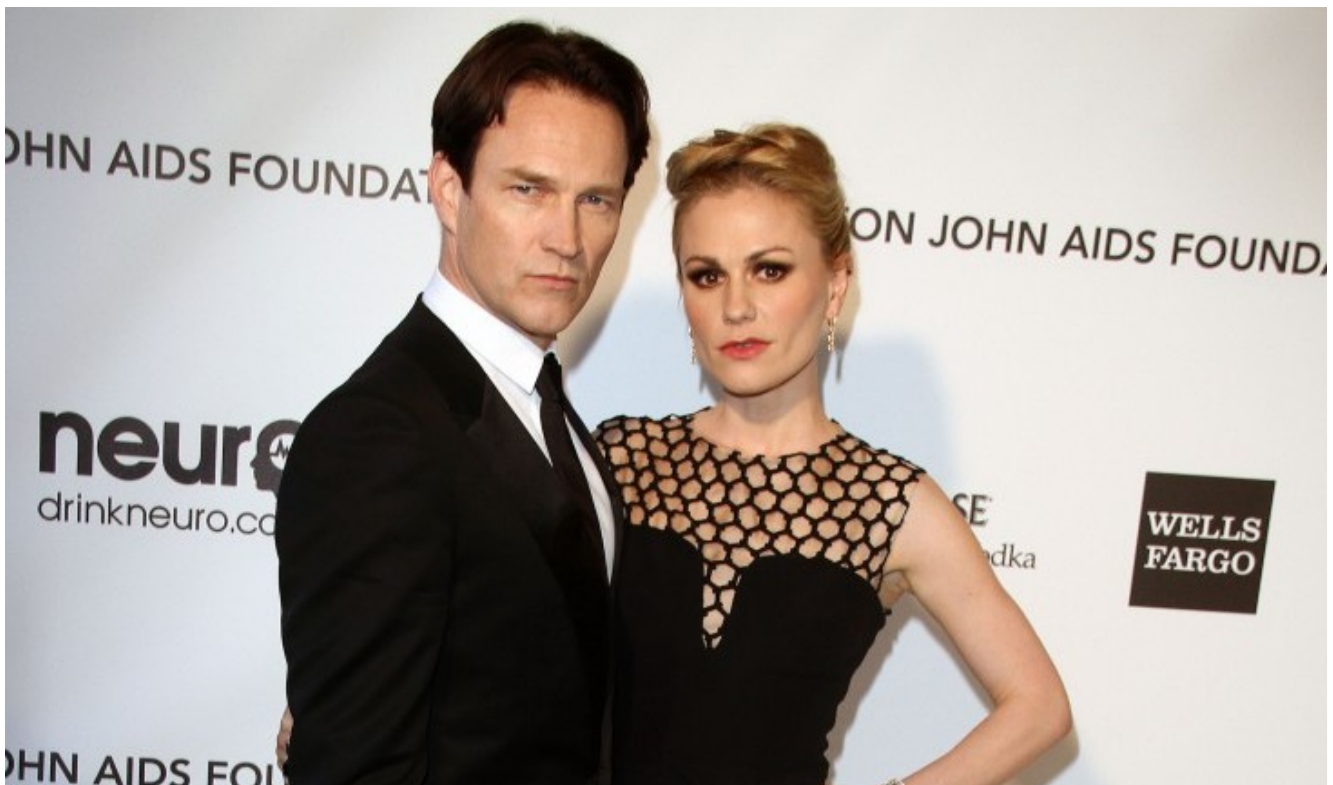
Stephen Moyer and Anna Paquin

These sexy stars of 'True Blood' wed in 2010, paying no