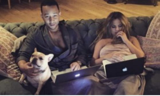
John Legend and Chrissy Teigen.

time apart really does make the heart grow fonder!