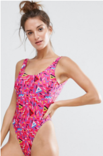
80s Sprinkles Print Swimsuit by ASOS.

Related Link: Fitness Trend: Why Aqua Cycling May Be for You