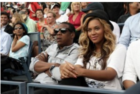
Jay-Z and Beyoncé.

4. Rebuild your relationship: This famous musical couple has been under the spotlight in recent years over a cheating scandal. Jay-Z can assure everyone that not every marriage is perfect. The rapper spoke with RollingStone.com and revealed that he had to rebuild his marriage with Beyoncé in order for them to be happy again. Sometimes hardships can make a marriage crumble, but sometimes you can make it work at the end of the day!