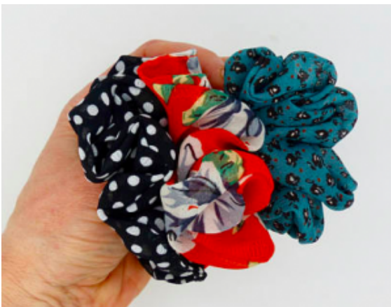
Hair Scrunchies from lemonyjen.

Scrunchies: Nobody likes to have their sweaty hair down during a workout! You can easily find scrunchies at your nearest drug store or fashion outlet. The perk of this hair accessory is that you can avoid hair breakage compared to a regular hair elastic.