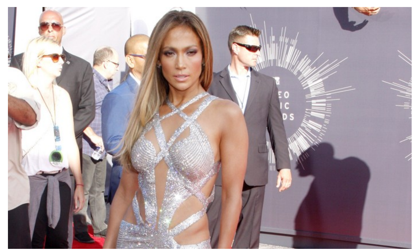
By Terry Hernon MacDonald of singlewomenrule.com

A happy marriage may be among life's greatest pleasures, but there's a lot to be said for living single. For too long, single men and women have been portrayed as unlovable, irresponsible, selfish, or childish. (The media tend to portray single celebs in their 20s as sexy, but once she – and in this case, it's usually a she – turns 30, the question, "Is there anyone special in your life?" comes with increasing frequency and feigned concern.)