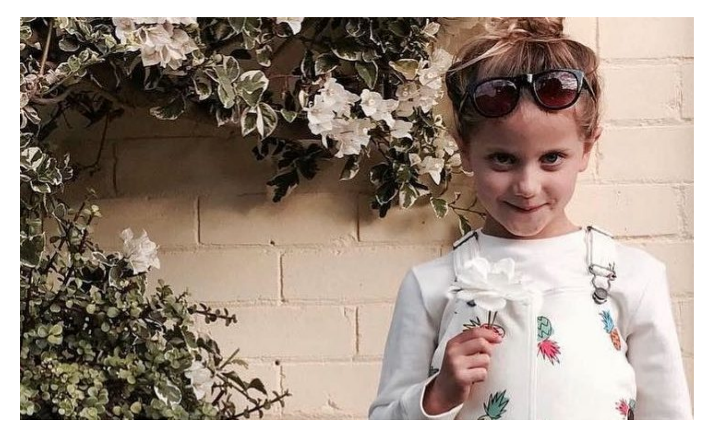
By April Littleton

What are the perks of waiting to find out the gender of your child?