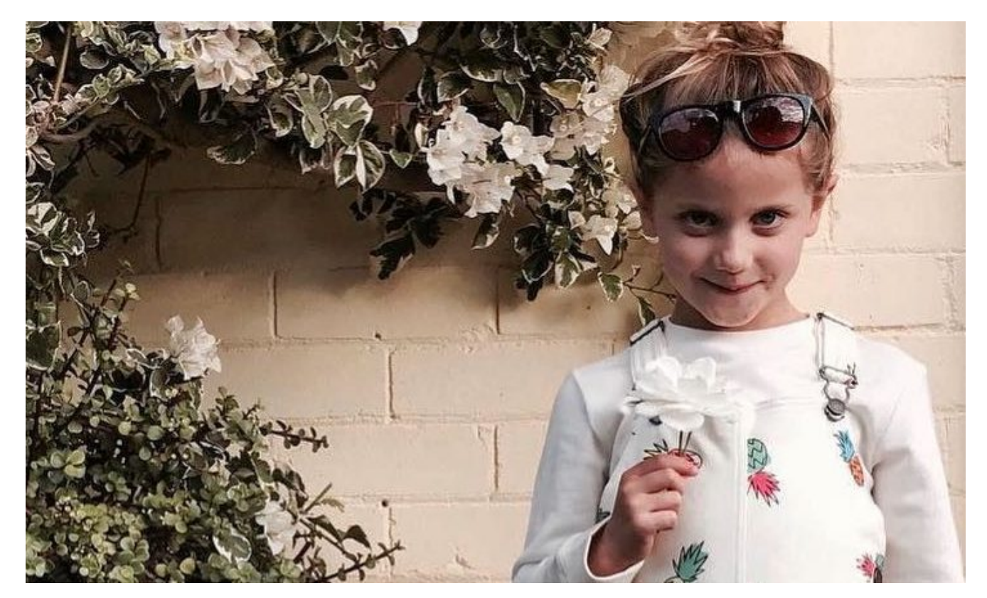
By Jennifer Harrington

It's no secret that the influence of Latino celebrities is growing every day (Latino celebrities have 600 million followers on Facebook and Twitter!). And with a new South American pope in office, Cinco de Mayo quickly approaching, and frequent news coverage of the growing Latino population in the United States, we figured it was a good time to look at the hottest Latino/Latina celebrities. Here's Cupid's opinion of who is sizzling!