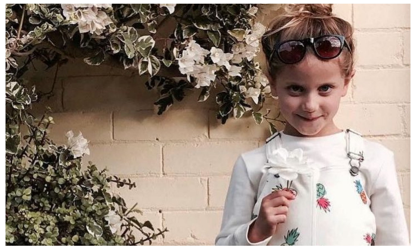
By <u>Noelle Downey</u>