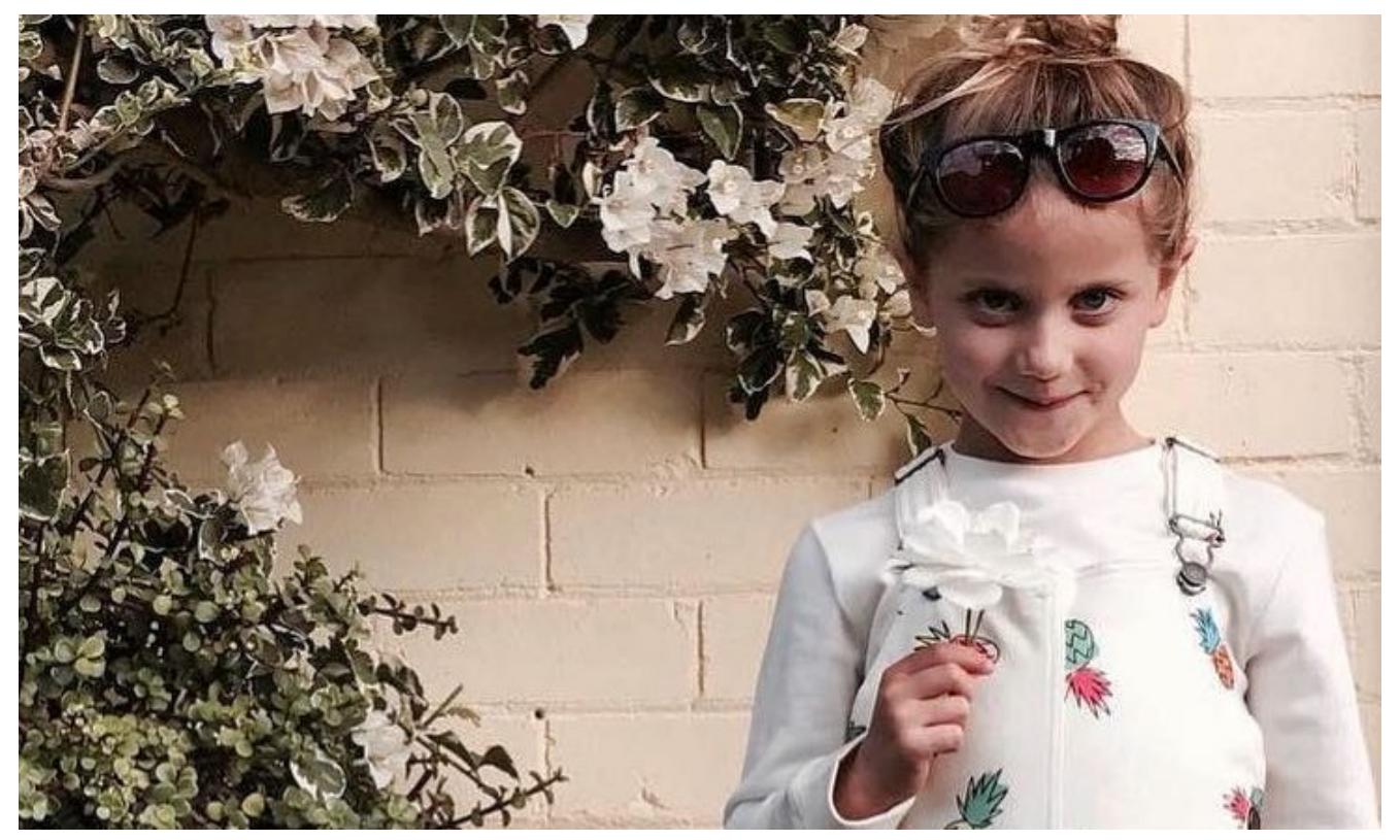
By Noelle Downey

There's no doubt about it, we all love to keep up with what the stars are wearing, whether on the red carpet or while stepping out of the gym, so we know what fashion standards to strive for with our own wardrobes. But what about when it comes to dressing our kids? While celebrity fashion trends for children featured in magazines can look adorable, are they actually kid-friendly? And do celebrity kids actually wear them? Well, now your fashion fears are over! We here at Cupid's Pulse have compiled a list of the top five most fashionable brands that celebrity kids wear and celebrity