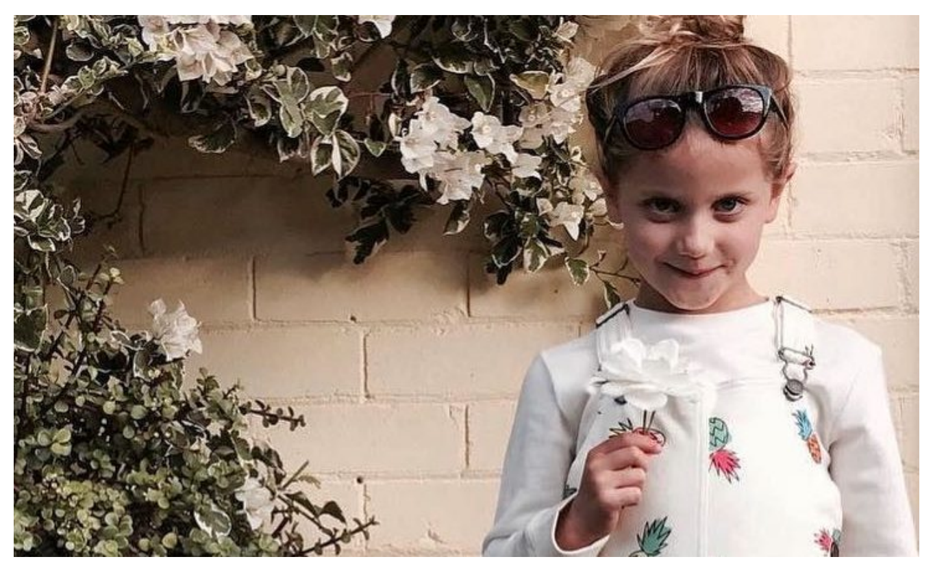
Page 1 of 19