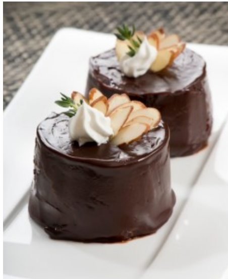
Almond Joyous Cheesecake Cuties.