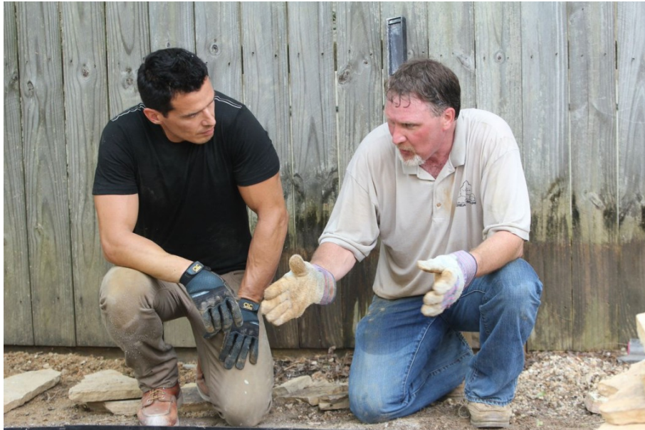
Antonio Sabato Jr. filming for 'Fix It or Finish It.'

Lastly, how are things going with Fix It and Finish It ?