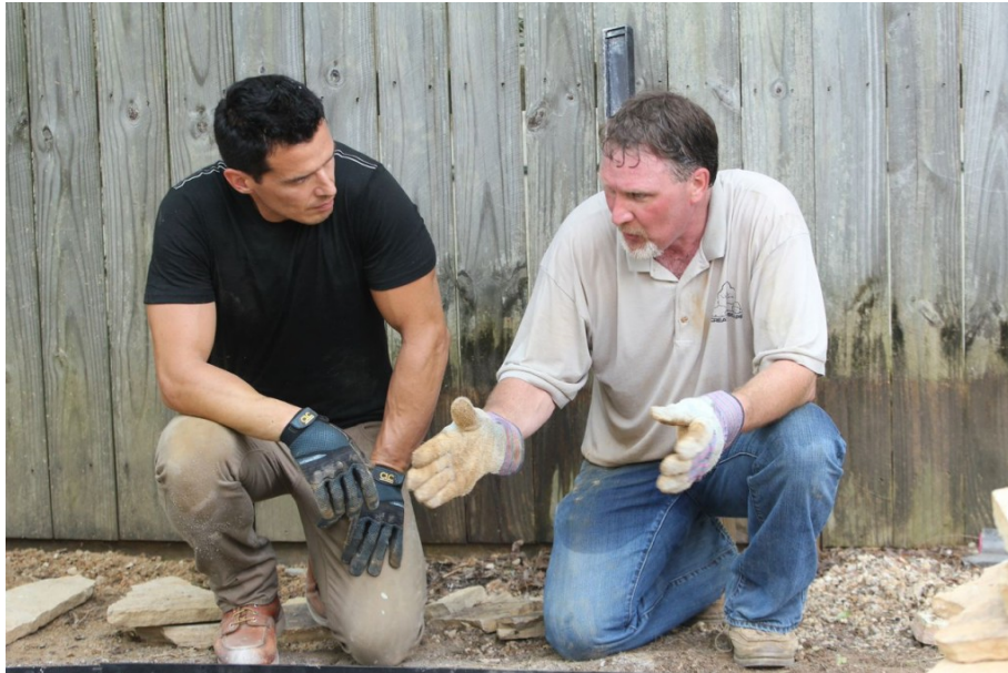
Antonio Sabato Jr. filming for 'Fix It or Finish It.'

Lastly, how are things going with Fix It and Finish It ?