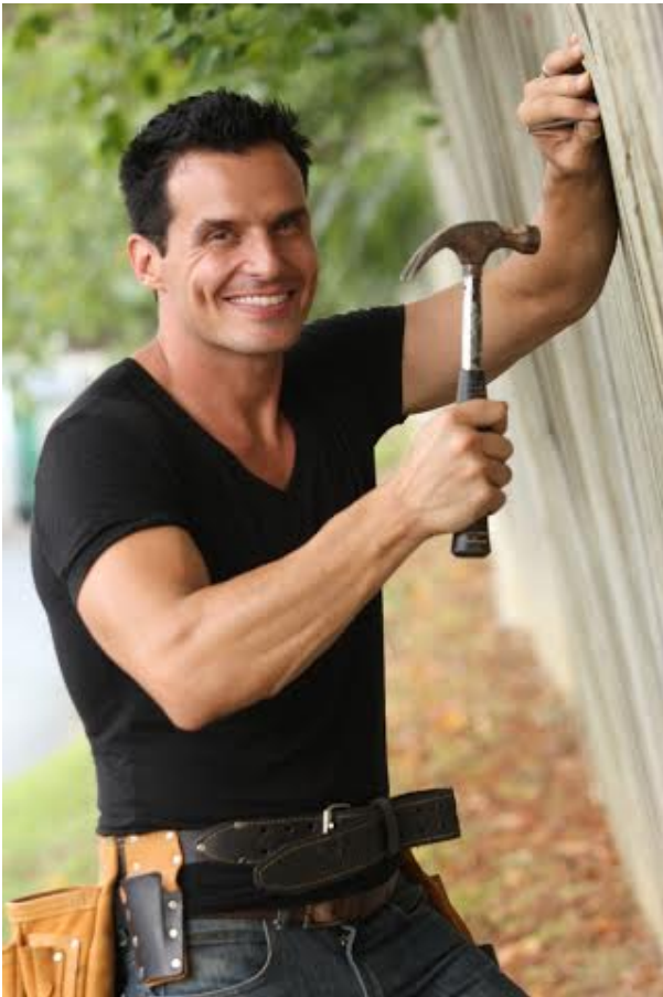
Antonio Sabato Jr. on ‘Fix It and Finish It.’