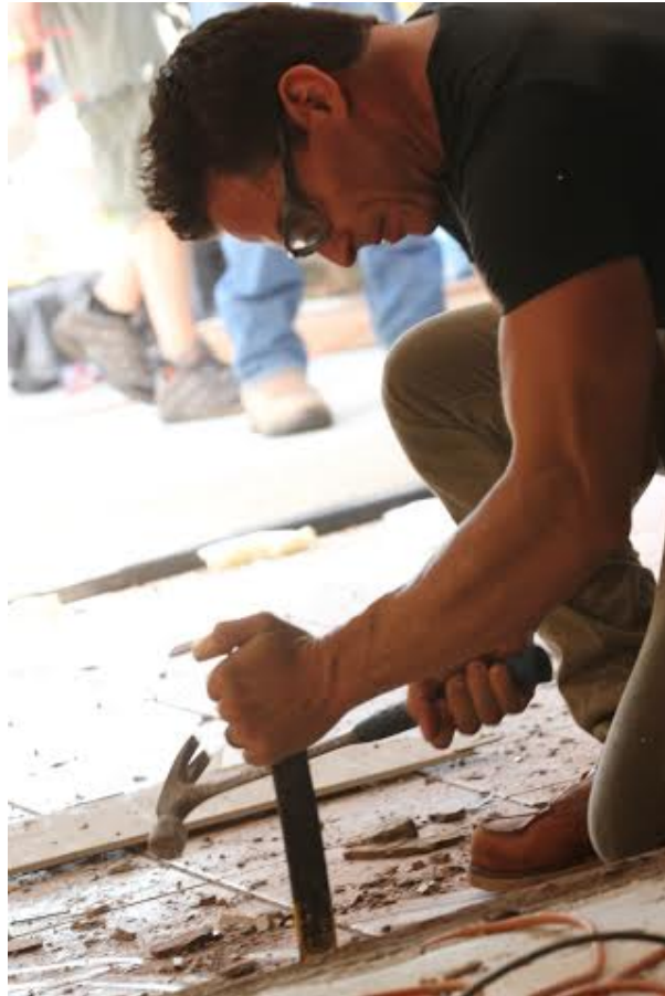
Antonio Sabato Jr. on 'Fix It and Finish It.'

It's clear that the actor believes life is about embracing new experiences. "It's about taking chances, trying new things. I don't like to follow the herd. I do whatever I feel like doing," the reality TV star says in our celebrity interview. "I feel like doing things that come my way, and I just take it one day at a time. DWTS is another opportunity to do something that is quite amazing, actually, in such short amount of time. You can't refuse that!"