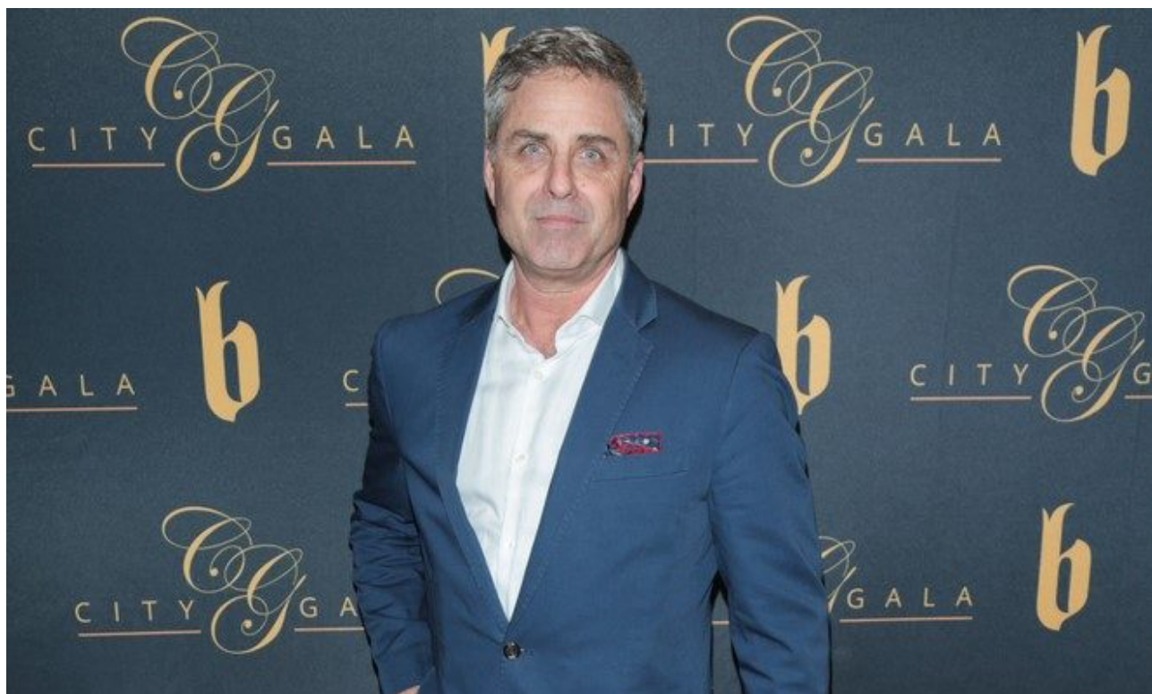
Mark L. Walberg.

physical infidelity or emotional connection? Walberg seems to think that a lacking emotional connection is much scarier than a physical infidelity. Physical intimacy doesn't always cause a bond to form, and he agrees with viewers who believe that emotional connections are the ones that are lasting.