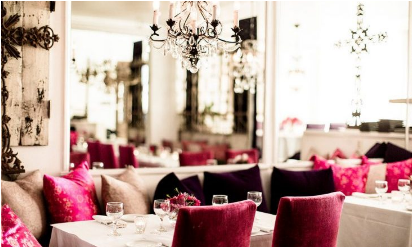
An elegant dining area at SUR