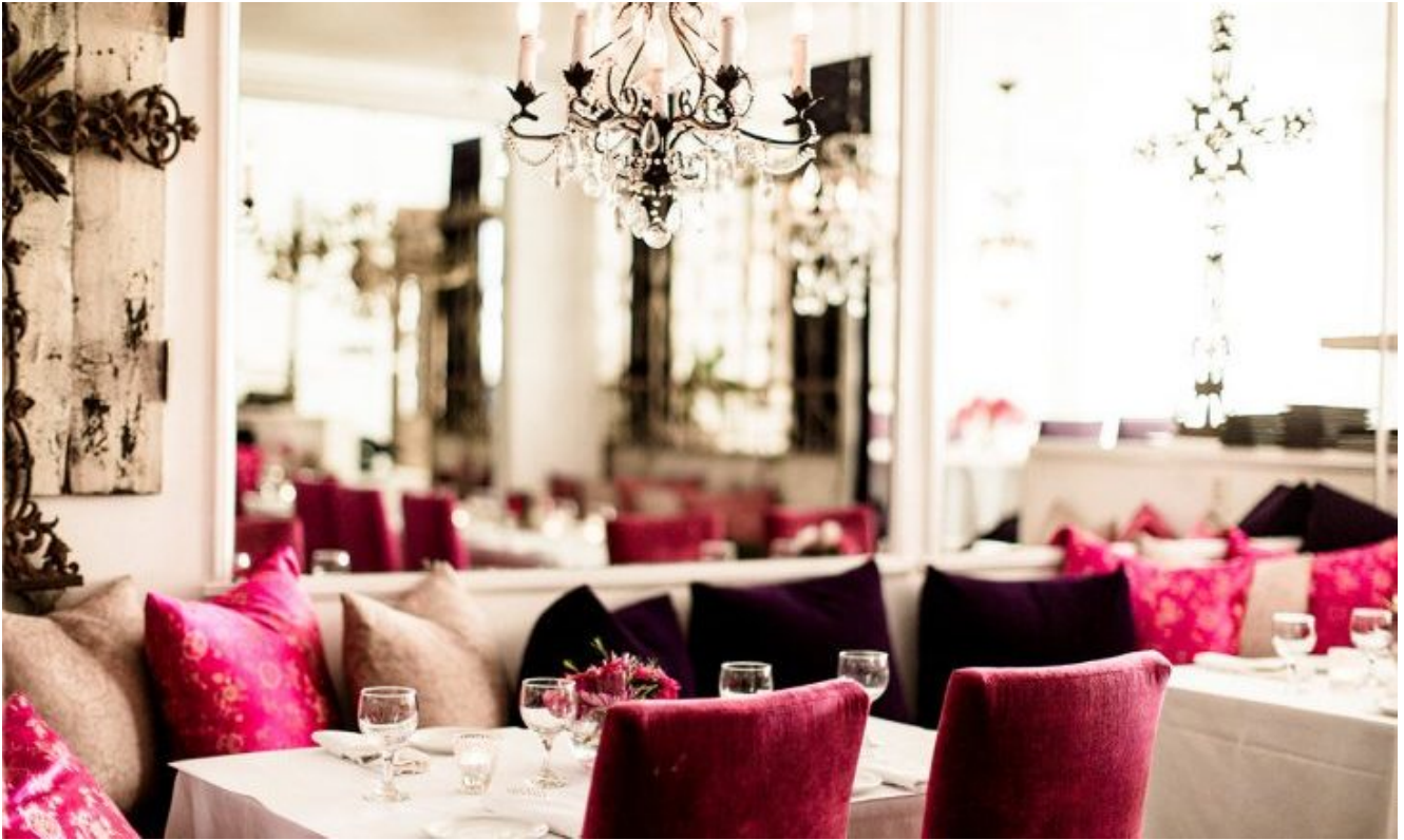
An elegant dining area at SUR