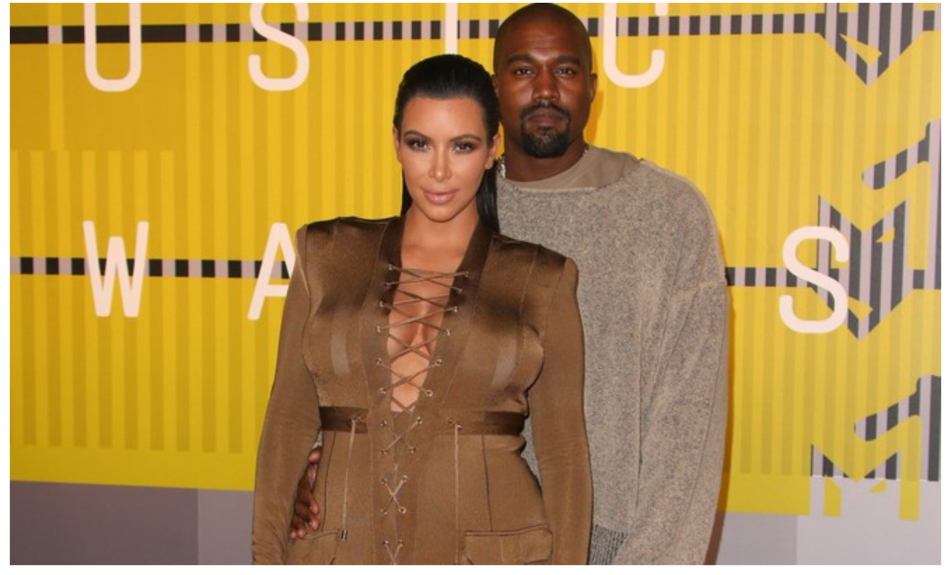
By Abbi Comphel