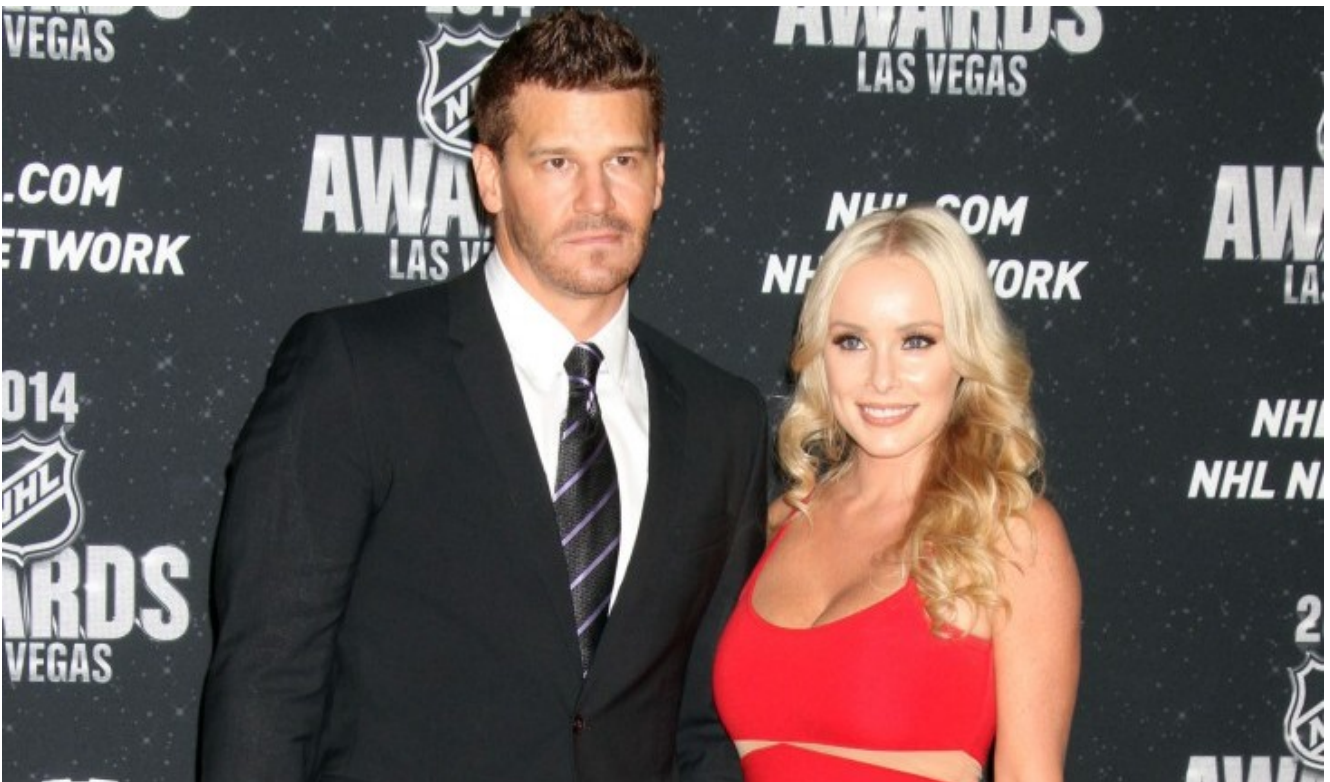
David Boreanaz and Jaime Bergman

The 'Bones' star admitted that he cheated on his model wife