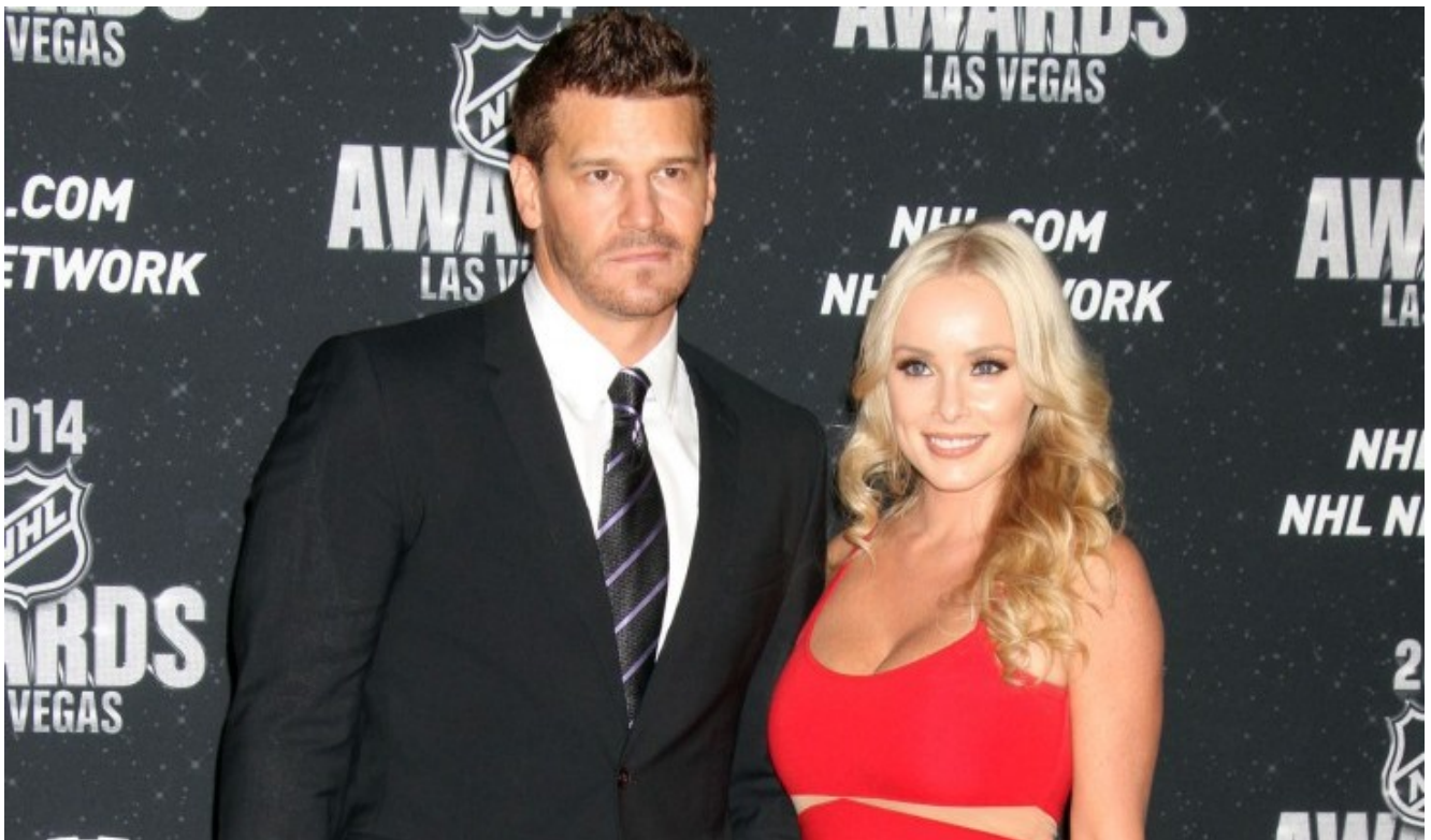
David Boreanaz and Jaime Bergman

The 'Bones' star admitted that he cheated on his model wife