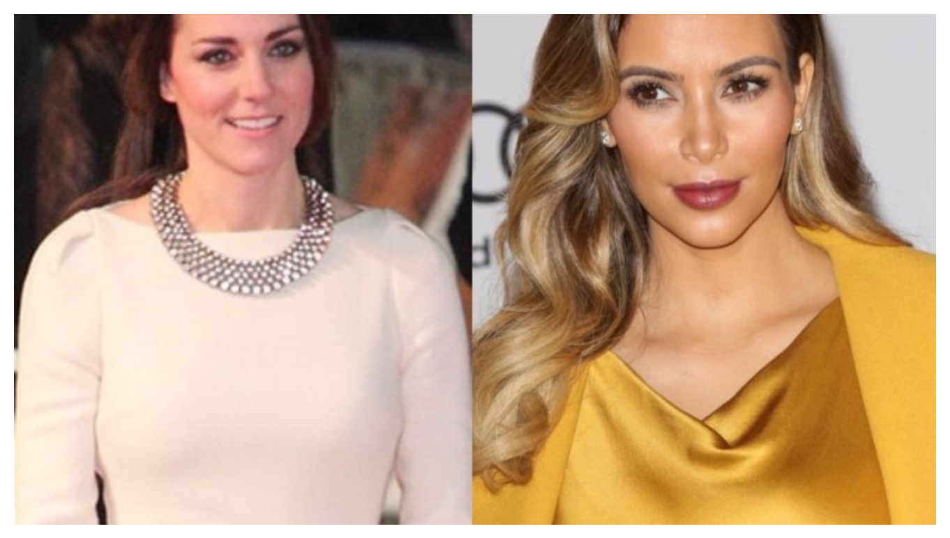
By Dixie Somers

Celebrity couples are almost always in sync in the fashion department. They coordinate their clothes most of the time, so their outfits usually complement each other. Here are the seven best-dressed celebrity couples we would all love to imitate in 2013: