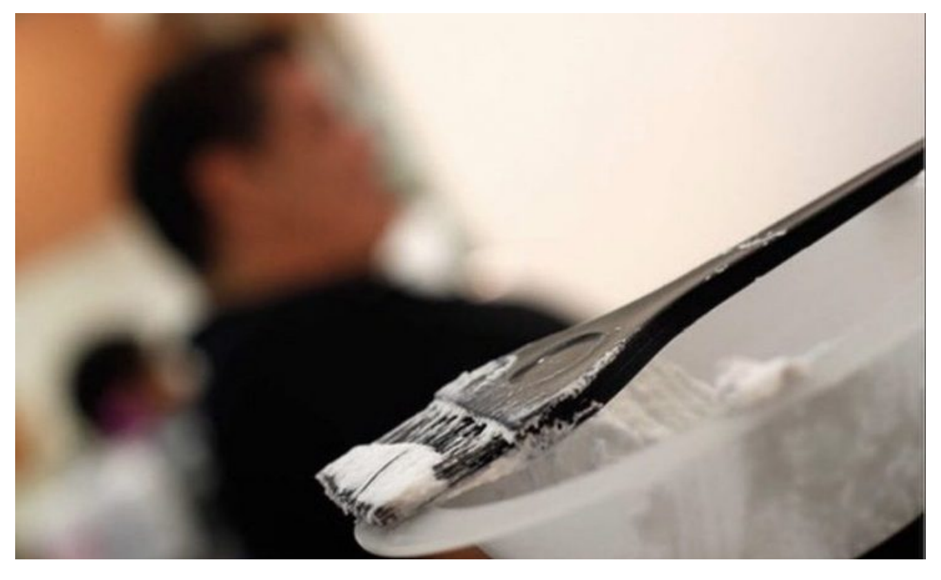
Page 1 of 20