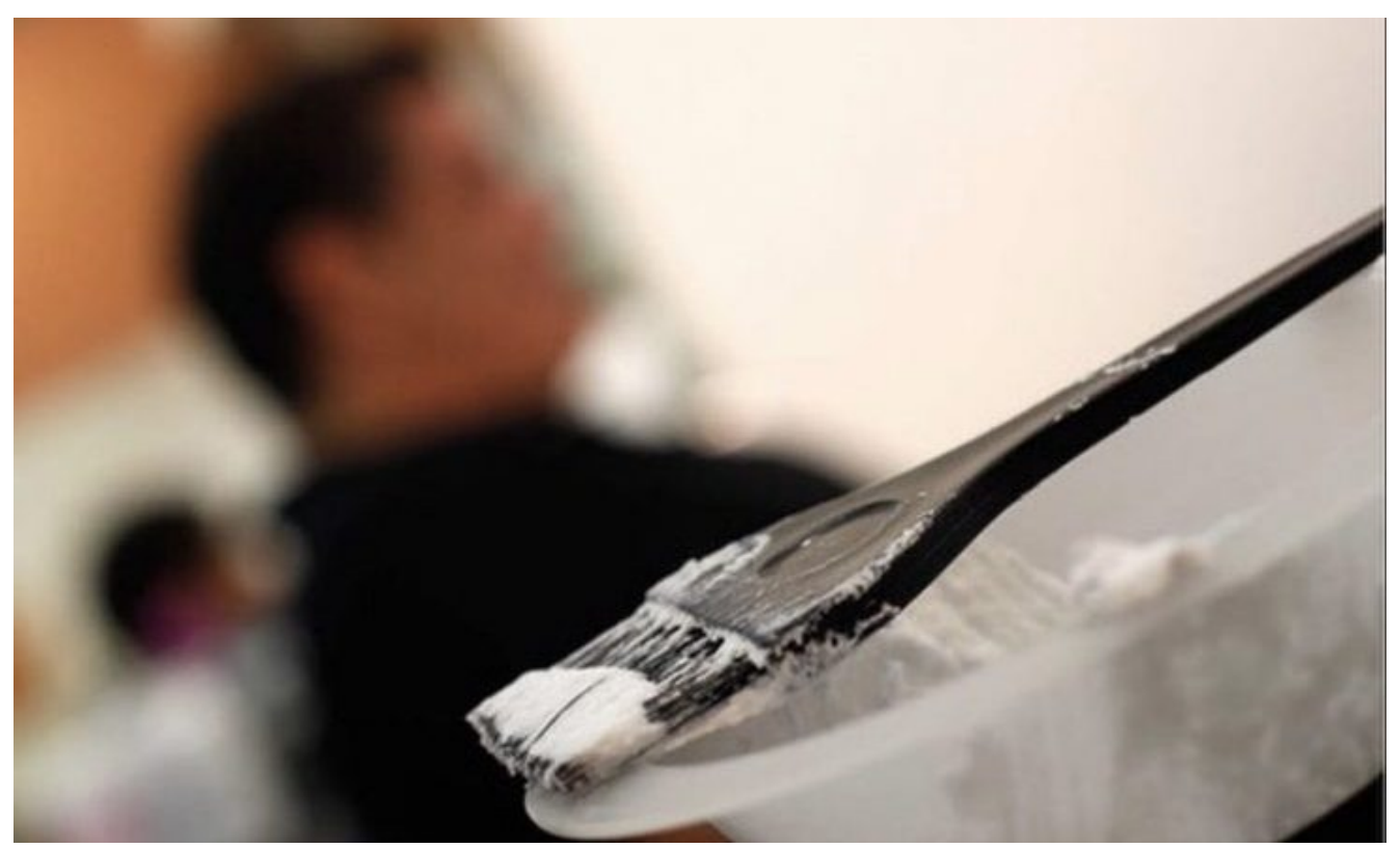
By <u>Melissa Lee</u>

It's no secret as to why celebrities are always in shape — between their personal trainers and strict diets tailored to their body types, being fit is basically part of their job descriptions. Fad diets are also typically made famous thanks to the stars that try them out, but thankfully, they tend to pass their wisdom down to us in regard to whether or not they even work. In the mix of all those crazy diet tips (say goodbye to juice cleanses!), there are actually a few diets that are quiet effective — luckily, Cupid is here to explain which celeb diets work.