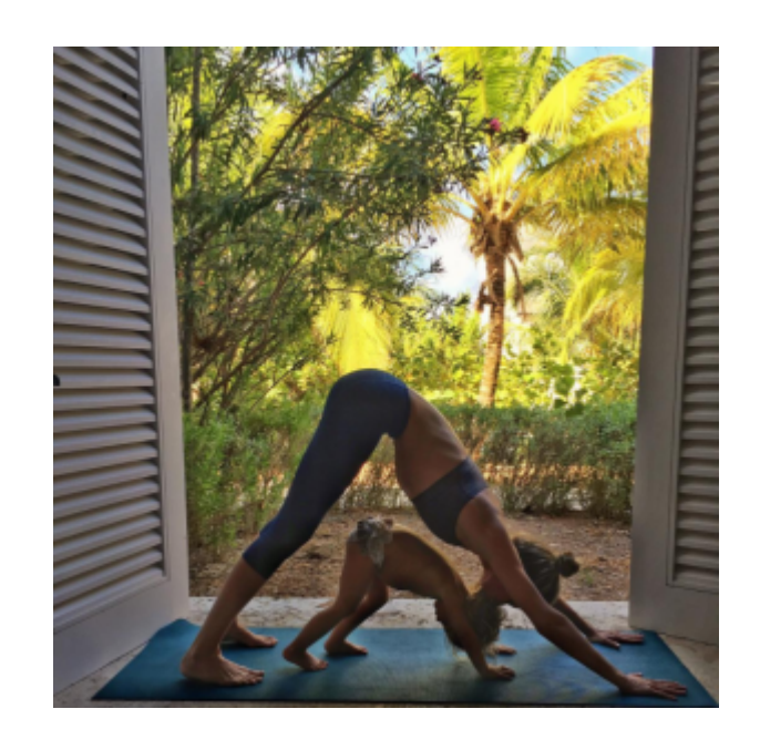
Related Link: <u>Gaiam Product Review:</u> <u>Learn Yoga and the Art of Self-Love with Rachel Brathen</u>

3. Eva Longoria's Tree Pose: This Desperate Housewives star is skilled at perfecting the tree pose! Like Eva Longoria, slowly put your weight on your left foot and bend your right knee. For support, gently grab your right ankle with your right hand. Make sure your right foot is placed on your inner left thigh by adjustment of the heel near your left groin muscle. Stretch your tailbone to the ground and press your hands together above your head forming a triangle. This pose will help you achieve excellent posture and balance.