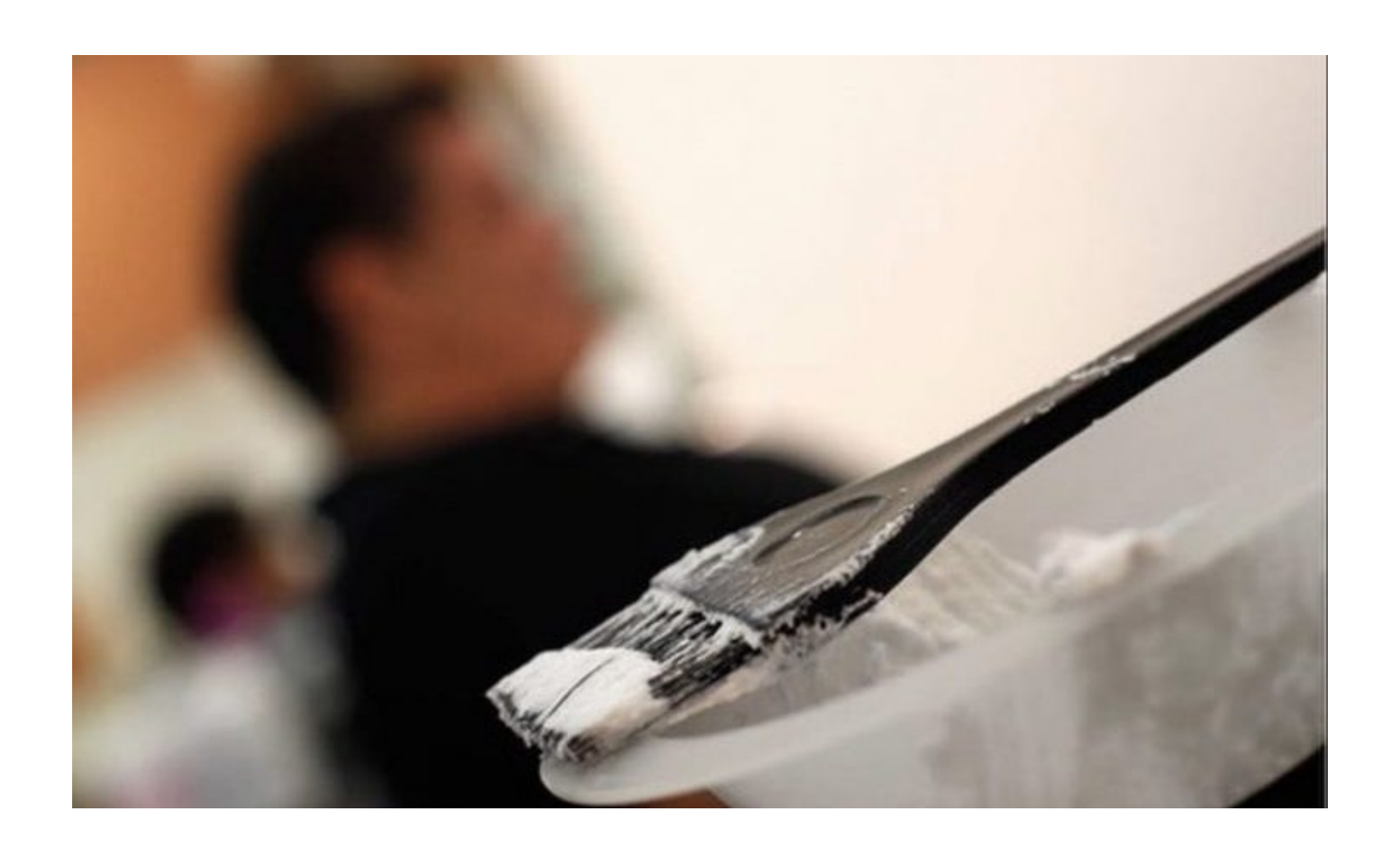
Page 1 of 20