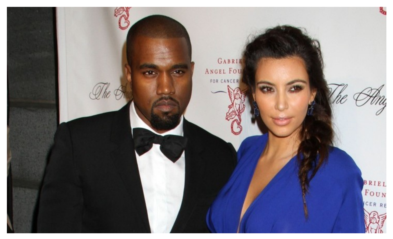
By Nisha Ramirez

It's hard to be in the spotlight 24/7, but celebrity relationships can make that even harder. Famous people are known for pairing up with other stars for publicity or because of their poor judgment, but neither ensures success. Whether they find each other before they make it big or start out their relationships at the top of their careers, it seems like celebrity relationships always end badly. It's no surprise that many celebs often seem on the verge of a breakup, and the following celebrities are some of the many who seem better off single: