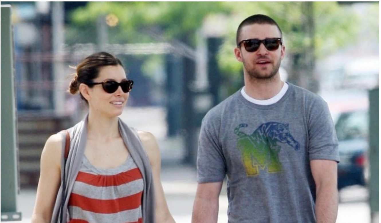
Jessica Biel and Justin Timberlake

The duo that sweats together, stays together! This famous couple seems to believe this truth, as they are often seen jogging together.