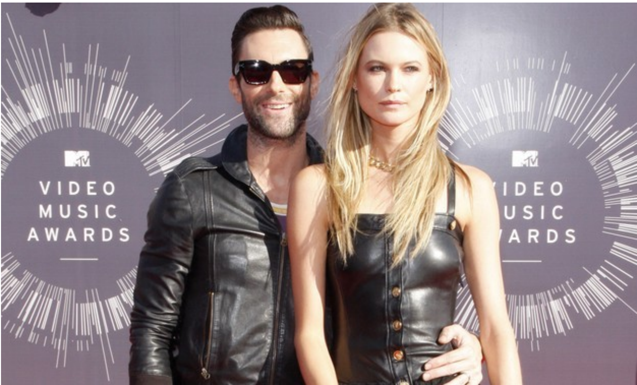
Adam Levine and Behati Prinsloo

This beautiful couple got hitched in July and walked their first red carpet as husband and wife at the MTV Video Music