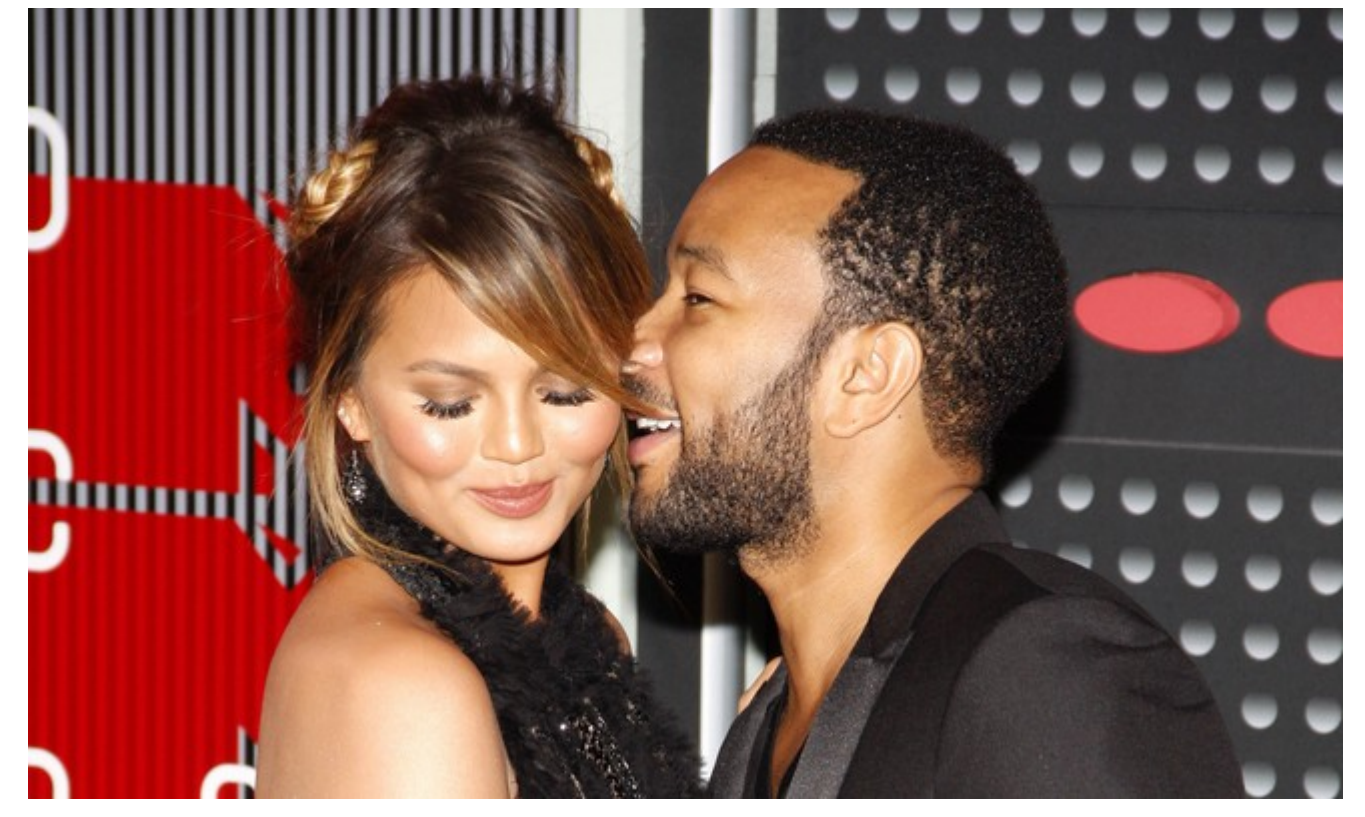
By <u>Dena Linzer</u>

In latest <u>celebrity news</u>, the adorable <u>celebrity couple</u> <u>John</u>