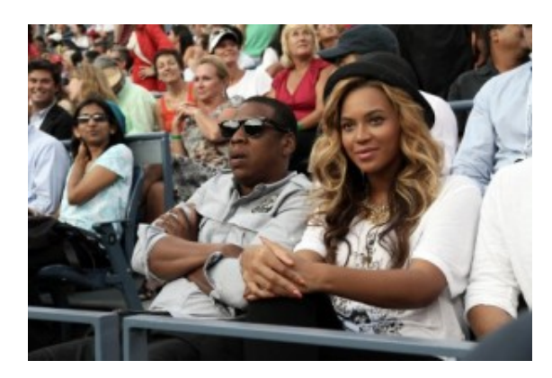
Jay-Z and Beyonce.

been under the spotlight in recent years over a cheating scandal. Jay-Z can assure everyone that not every marriage is perfect. The rapper spoke with RollingStone.com and revealed that he had to rebuild his marriage with <u>Beyoncé</u> in order for them to be happy again. Sometimes hardships can make a marriage crumble, but sometimes you can make it work at the end of the day!