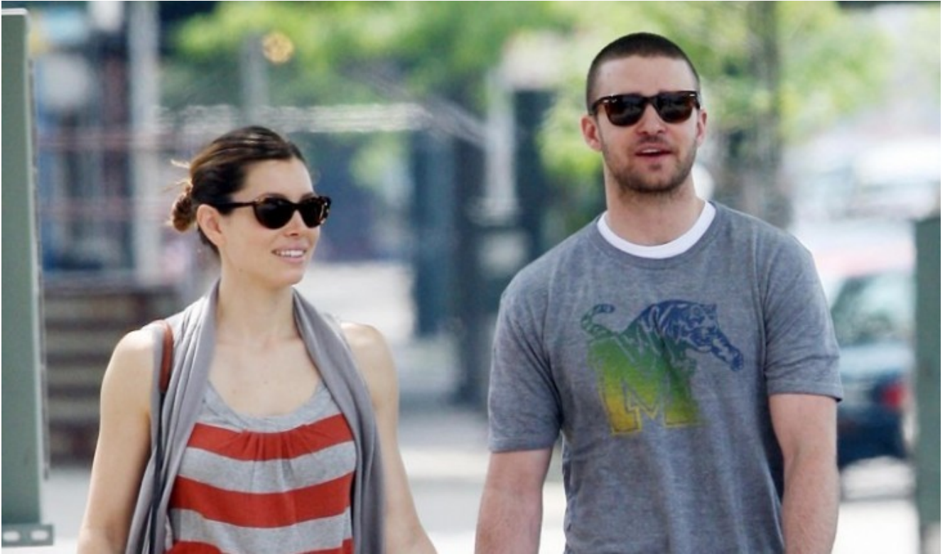
Jessica Biel and Justin Timberlake

The duo that sweats together, stays together! This famous couple seems to believe this truth, as they are often seen jogging together.