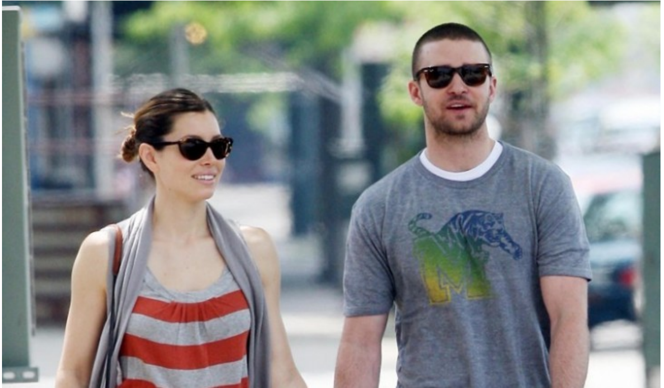
Jessica Biel and Justin Timberlake

The duo that sweats together, stays together! This famous couple seems to believe this truth, as they are often seen jogging together.