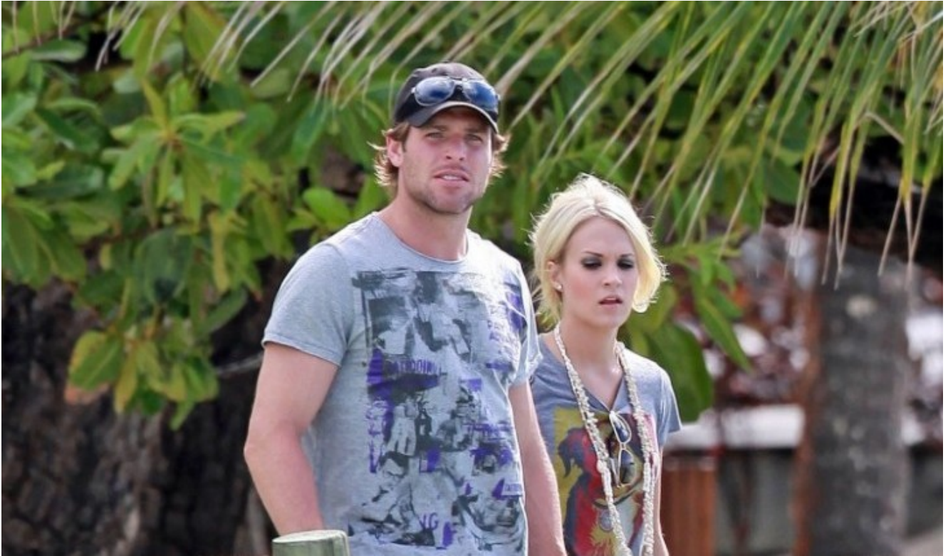
Mike Fisher and Carrie Underwood

The Nashville Predators hockey player and country singer got married in Georgia in July 2010, and then they hopped on a plane to celebrate their honeymoon in Tahiti. The celebrity couple spent their time soaking up the sun on this beautiful island in French Polynesia.