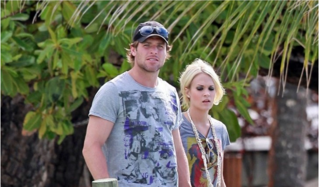
Mike Fisher and Carrie Underwood

The Nashville Predators hockey player and country singer got married in Georgia in July 2010, and then they hopped on a plane to celebrate their honeymoon in Tahiti. The celebrity couple spent their time soaking up the sun on this beautiful island in French Polynesia.