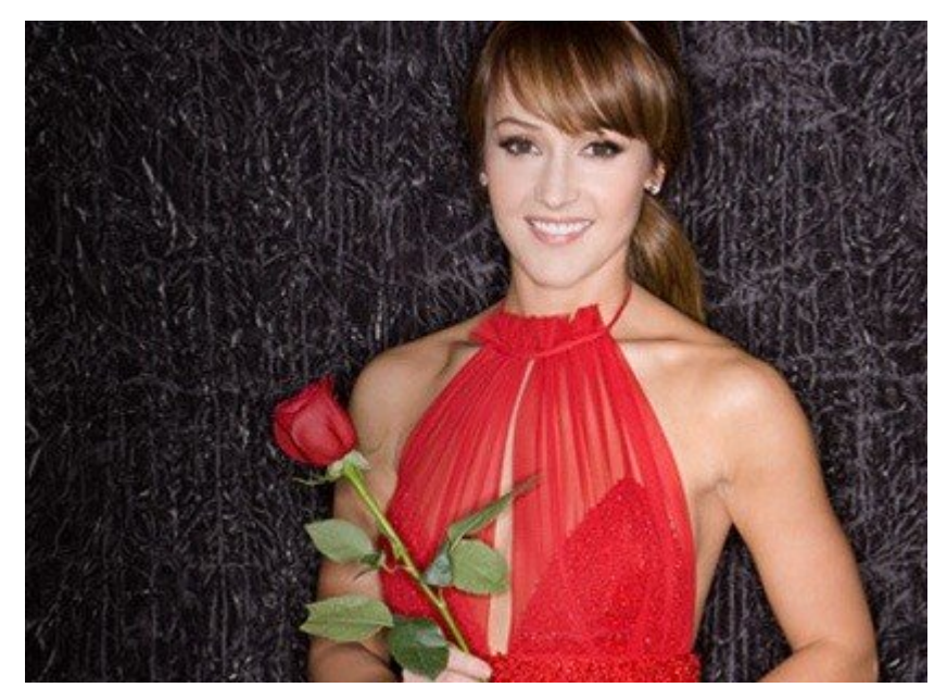
This post is sponsored