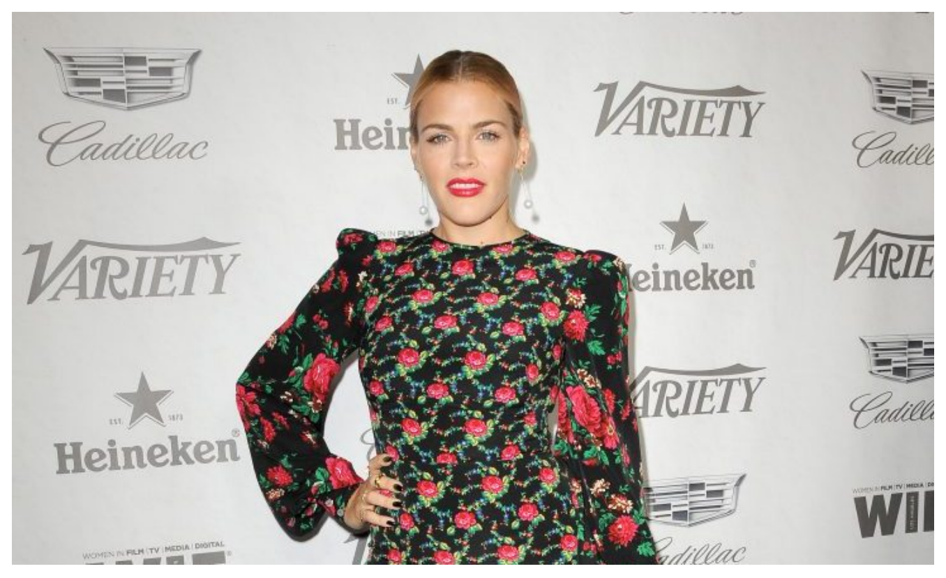
Page 1 of 15