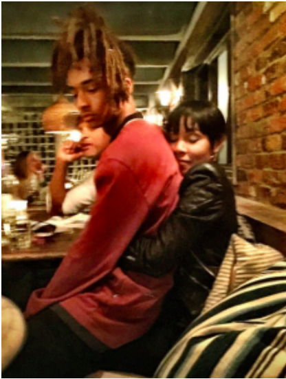
Jada Pinkett Smith and Jaden Smith.

Related Link: Celebrity Children Who Are Just Like Their Parents