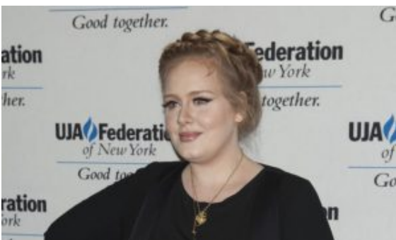
Adele.