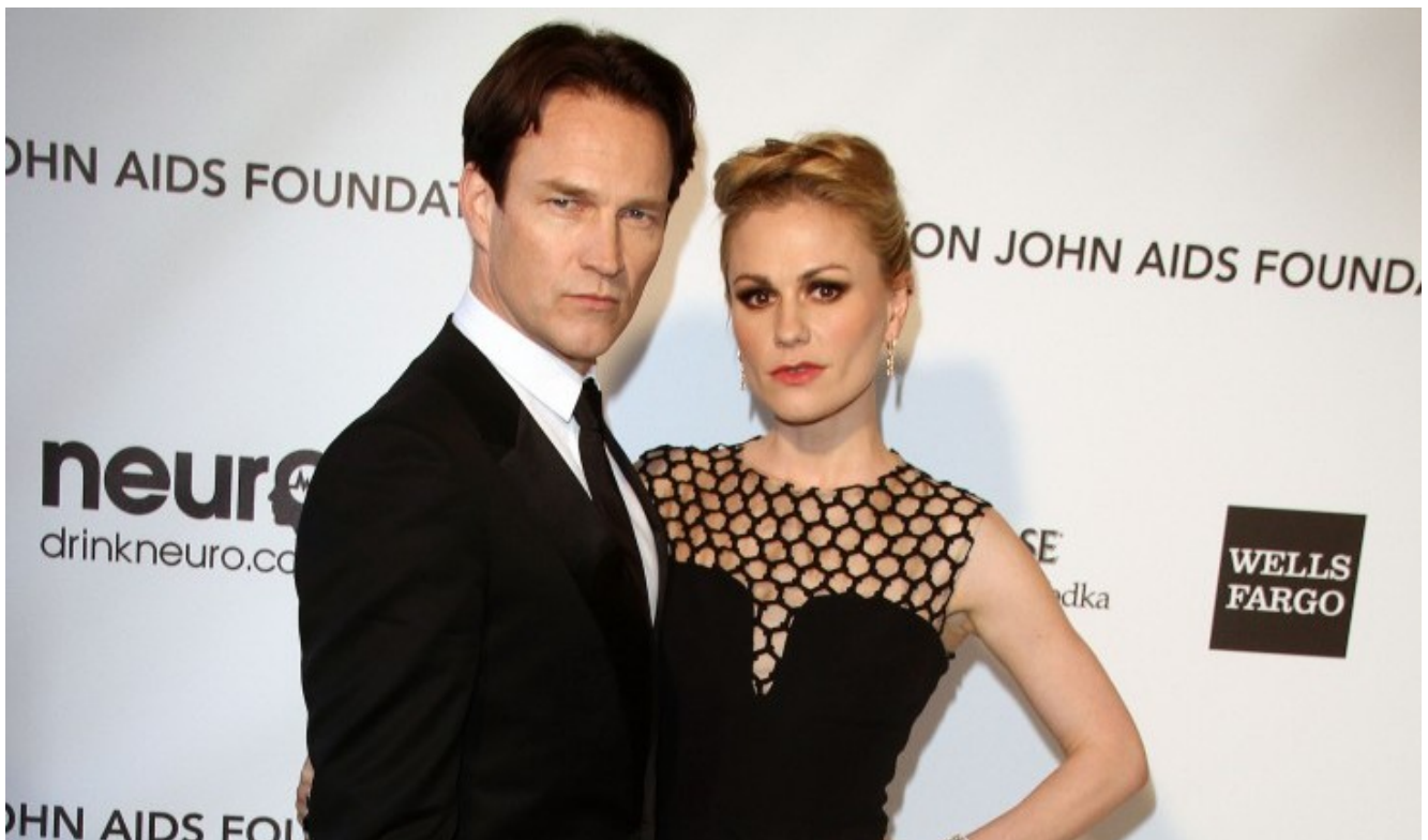
Stephen Moyer and Anna Paquin

These sexy stars of 'True Blood' wed in 2010, paying no attention to their 12-year age gap. Moyer is 45 years old, and Paquin is 33 years old.