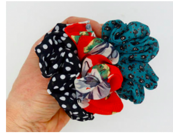
Hair Scrunchies from lemonyjen.

Scrunchies: Nobody likes to have their sweaty hair down during a workout! You can easily find scrunchies at your nearest drug store or fashion outlet. The perk of this hair accessory is that you can avoid hair breakage compared to a regular hair elastic.