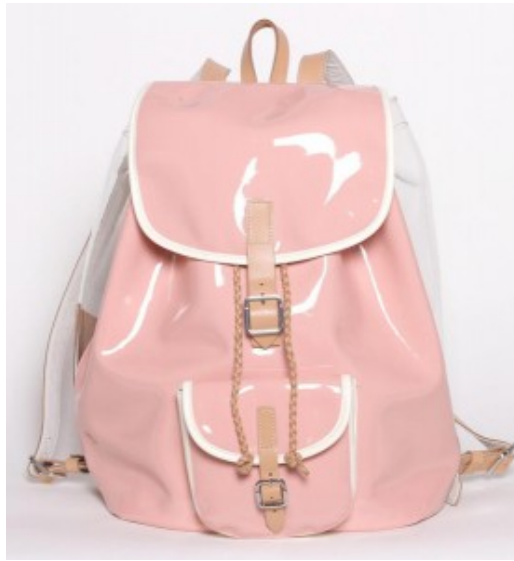
The Takashi bag by Harper Avenue.