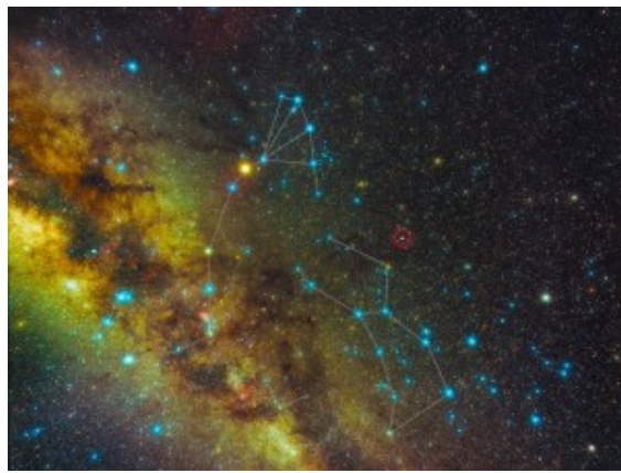
The Photographic Sky Chart.