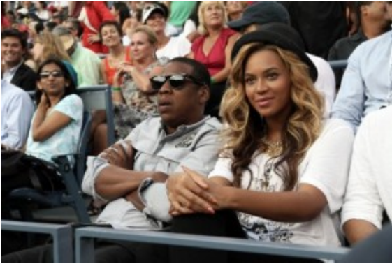
Jay-Z and Beyoncé.

Related Link: Relationship Advice: Making Marriage Work Like Beyoncé