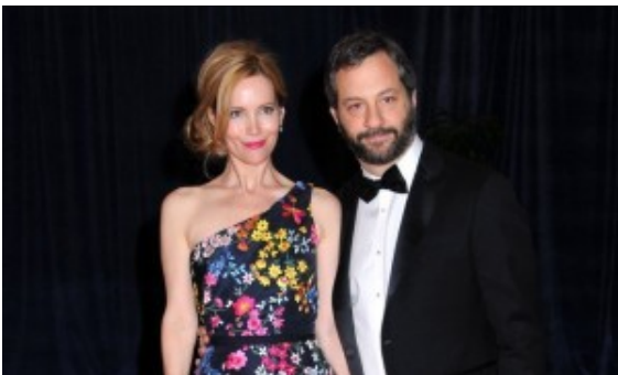
Leslie Mann and Judd Apatow.

5. Watch Oprah together: The funny duo Leslie Mann and Judd Apatow have worked together on many romantic comedies together and have been married for 20 years! The director shared with Vice.com that they both watch Oprah's SuperSoul Sunday and then apply lessons from the show to their marriage each week. Television shows that give you relationship advice can be helpful for you and your partner!