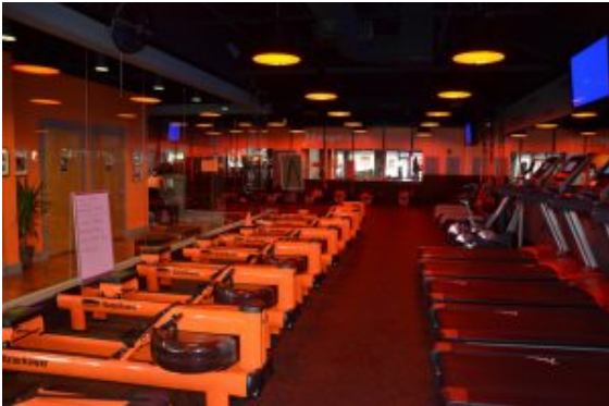
Orangetheory Studio.

workout that is going to push you to your breaking point. Each member must pass through five zones of interval training. Some of these interval training include working out on treadmills, rowing and weights. The after burn of this workout is intense, but if you want fast results and are looking to dedicating yourself to a powerful fitness program, Orangetheory is the place to go!