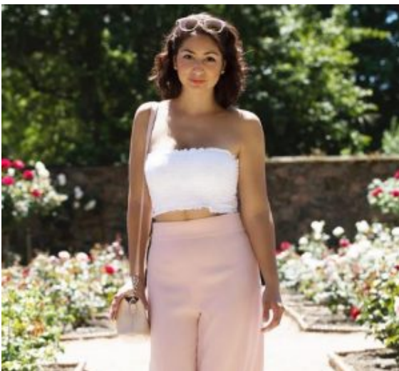
Bandeau with high-waisted

Related Link: Fashion Trends: 5 Best Ways to Wear Your Favorite Spring-Time Dress