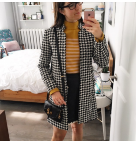
Houndstooth jacket.

2. Hounds-tooth: Honestly, this pattern is classic and timeless. Start adding small pieces to your closet that you can incorporate into an everyday look.