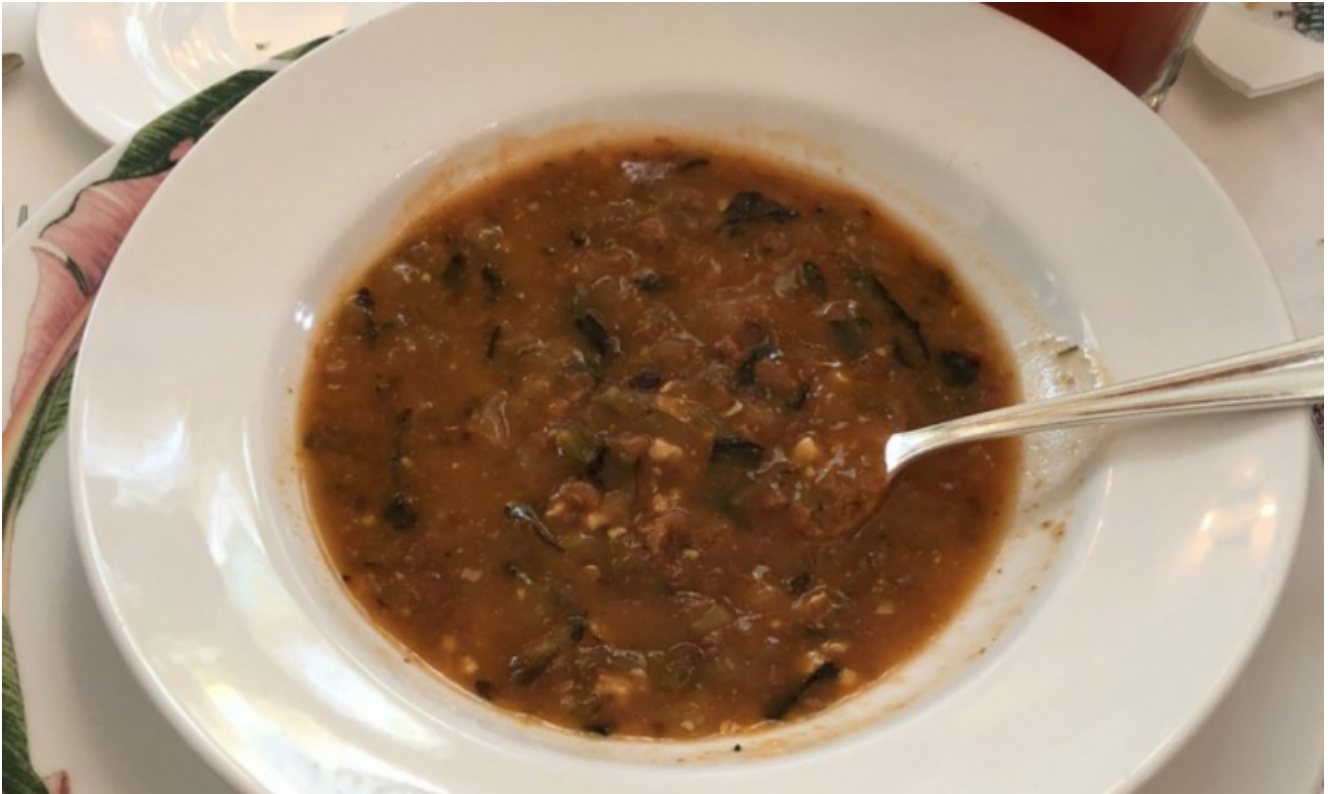
Commander's Palace Turtle Soup.

Thanks to the owner's pride in the restaurant and these famous chefs, Commander's Palace is a world-class restaurant you'll be dying to try if you make a trip to New Orleans.