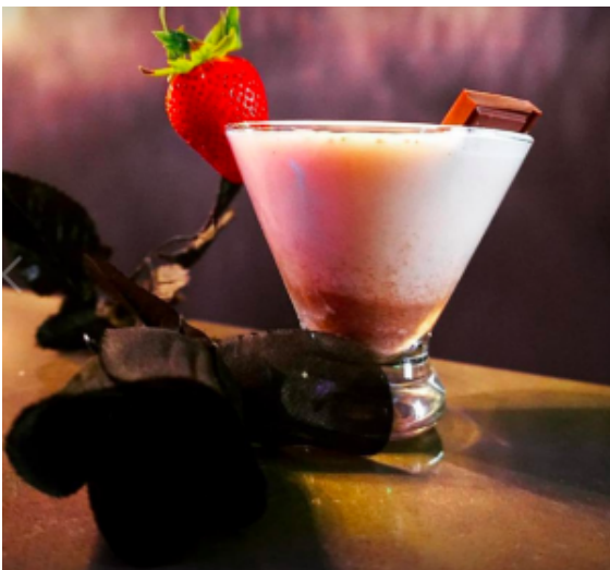
The Chocolate Factory Martini.

The Chocolate Factory Martini: Try a sip of rich and creamy drink that will make you feel like a kid again! This remake of a kid-like treat is mixed with Dorda chocolate liqueur, creme de cocoa, cream, and Vanilla vodka. It's not purely your imagination, this drink is delicious as it looks!