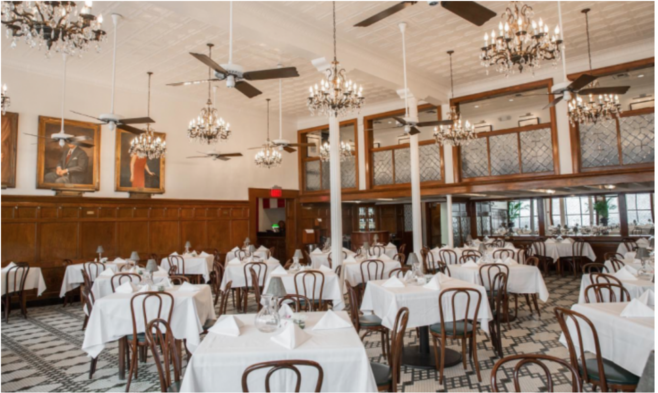
Arnaud's Fine Dining.

Arnaud's is great for a sophisticated taste of the French Quarter located only steps away from Bourbon Street. Want an elegant night out? Reserve dinner in the Main Dining Room. Or, if you're looking to add a little spice to date night , you can enjoy live Jazz music in the Jazz Bistro, all while eating some of the best Creole Cuisine that New Orleans has to offer. You can find more about Arnaud's and make reservations online at https://www.arnaudsrestaurant.com/ , or through social media on Facebook and Twitter .