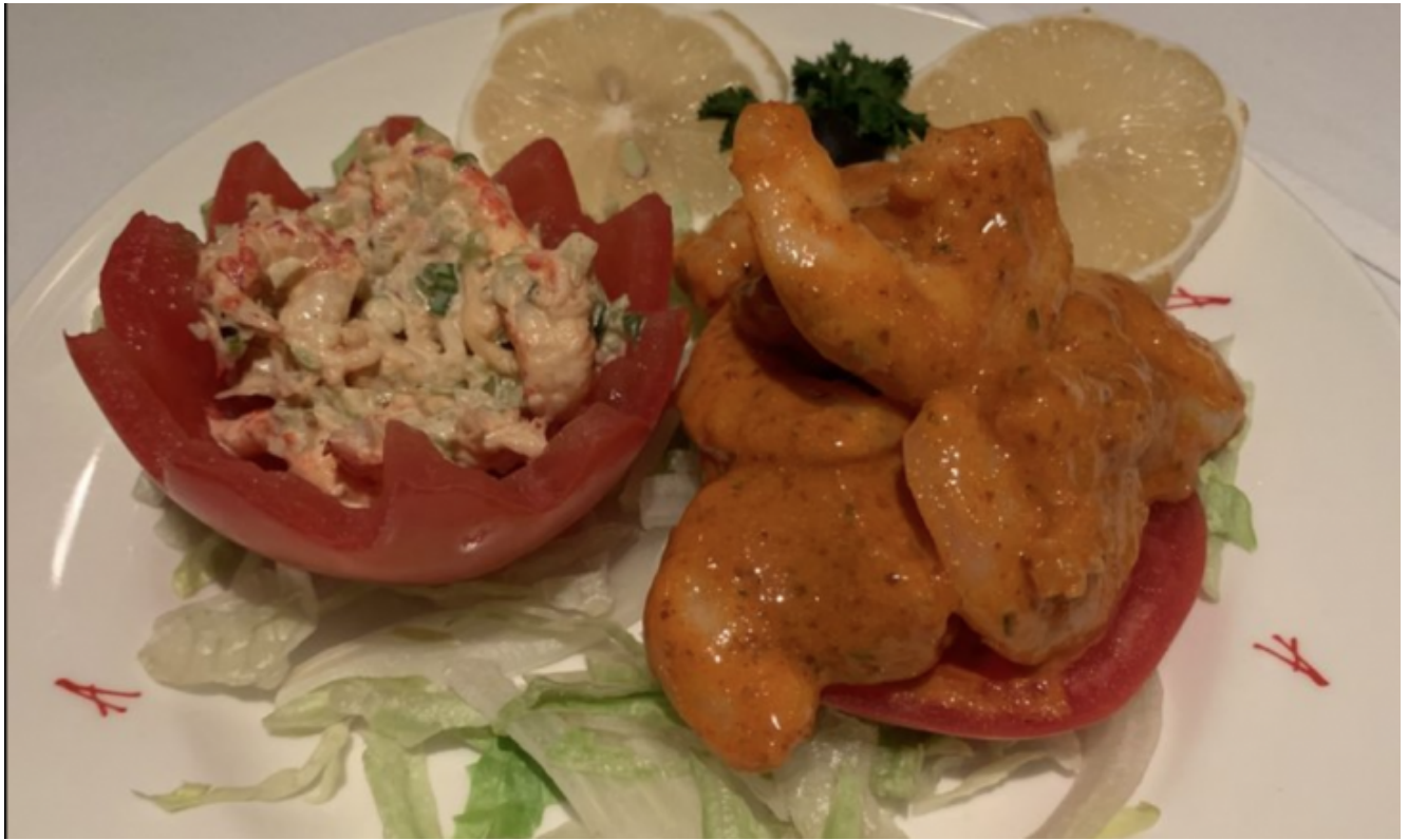
Arnaud's signature dish, Shrimp Arnaud.

Looking for a romantic dinner date that is bound to impress. Arnaud's offers two main dining areas that are sure to meet your needs. Looking for beautiful elegance, then book your reservation in the main dining room. How about a little music to liven up the night? Reserve dinner in the Jazz Bistro room and enjoy your classic Creole dish with a little pizzazz with some live Dixieland Jazz.