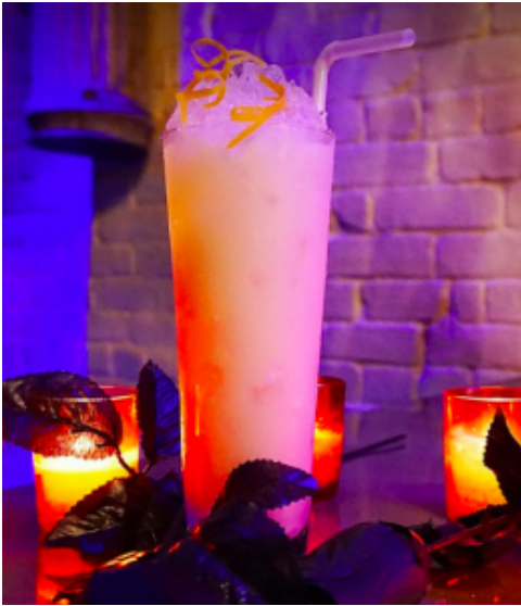
The Jack Skellington drink.

Related Link: Famous Restaurants: NYC's Most Popular Hidden Restaurants