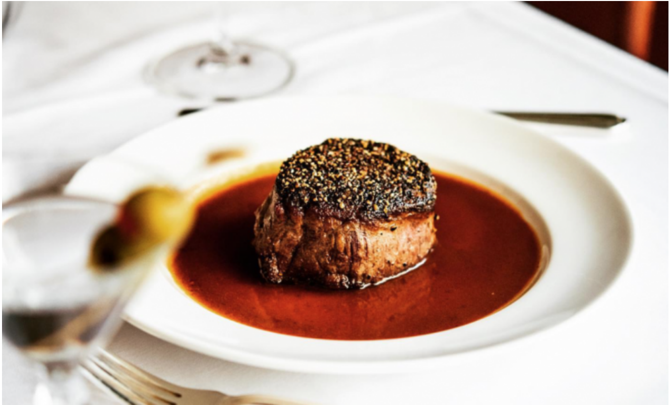
Arnaud's Filet Mignon.

This popular restaurant has a delicious Creole menu that is sure to keep you wanting to come back for more. They offer wonderful signature dishes like Shrimp Arnaud, Smoked Pompano, and Filet Mignon au Poivre. Everything is elegant from the rooms and decore, to the staff's attire and the guest dress code which recommends jackets for gentlemen in the Main Dining Room. You won't catch anyone wearing shorts and flip flops in this restaurant.