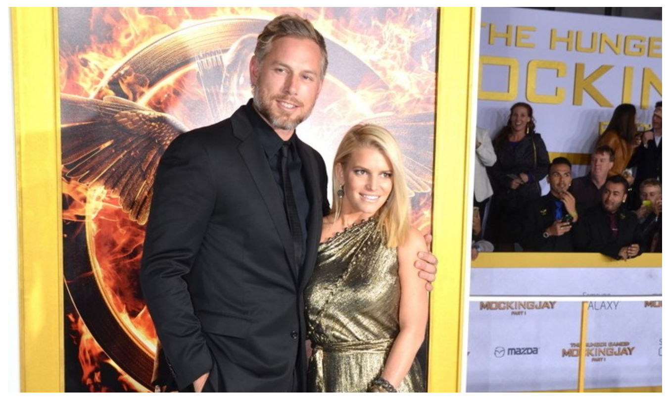
By April Littleton

The year 2013 is slowly drawing to an end, and it's only fitting to look back at some of the most memorable <u>celebrity</u> <u>couples</u> to grace the television screens and magazine covers. Here are Cupid's top 10 favorite famous lovebirds of this year: