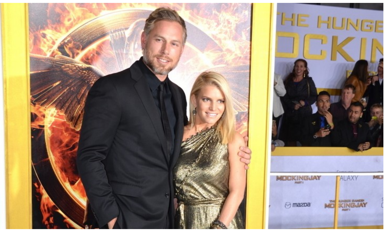
By Sandra Fidelis