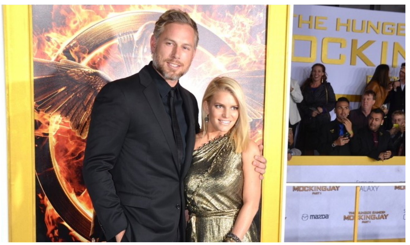
By Shannon Seibert

Tis the season to take pride in your homeland and rock the colors of vigilance, perseverance and justice. It's also the day where we sport killer bikinis, chow on barbecue and watch amazing fireworks displays. The best part about the holiday, though, is that it's a day in which our entire country takes pride in their homeland, especially our celebrities. We've pulled together the envy-worthy patriotic plans and traditions of these stars to hopefully inspire a little Independence Day tradition in your own household: