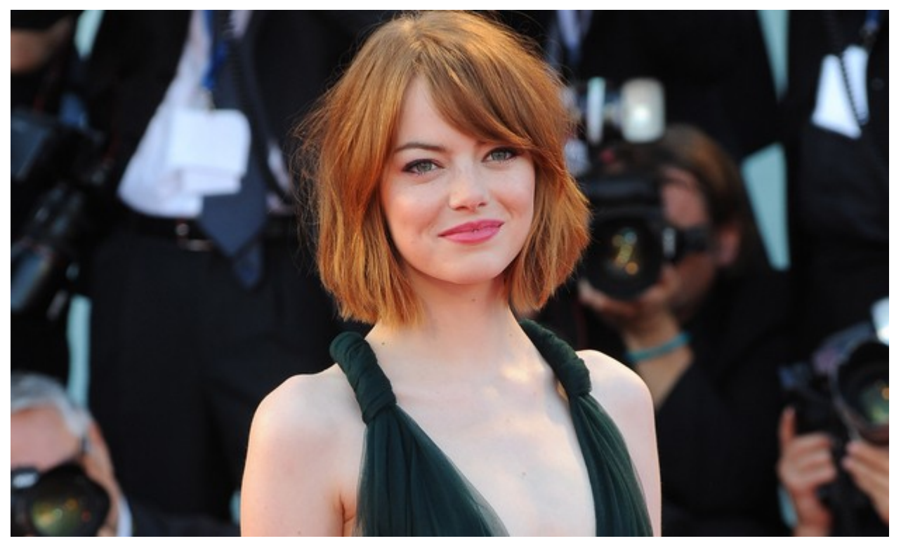
Page 1 of 20