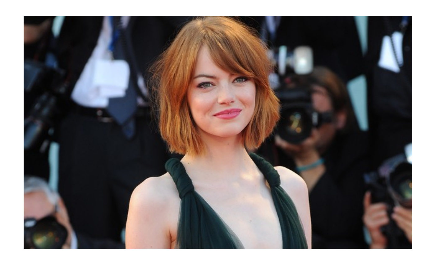
Page 1 of 10